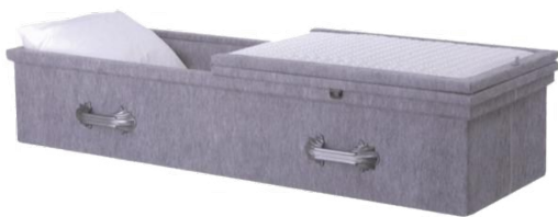
Cloth Covered $1045