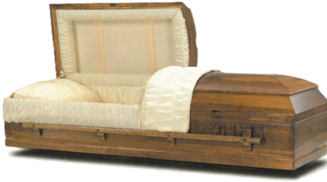
Freemont Poplar Veneer $2710