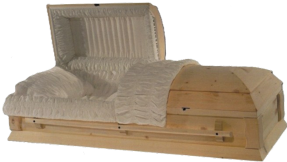
Rustic Pine Veneer $2575