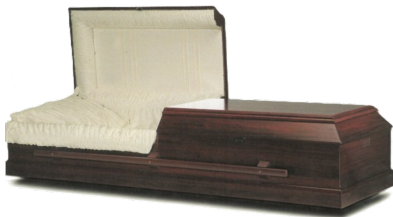
Kenton Walnut Finish $1815