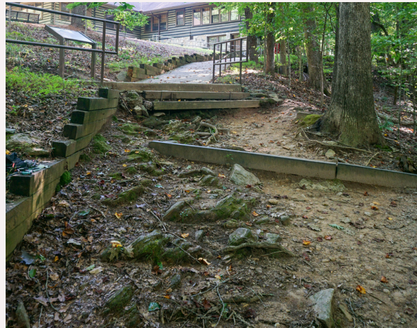
Example trails in need of restoration, rehabilitation, and/or closure at Island Ford Unit of CRNRA