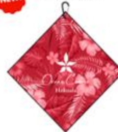
18" x 18" MOQ=48 (9pcs/color)

ALSO AVAILABLE (not shown) 18" x 40" MOQ=36 (6pcs/color)