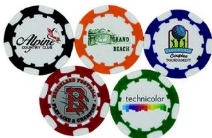
Poker Chip with Logo (Min. 100- Price $2.50)

Divot tools start at $10 per item including logo. Onetime setup charge of $50 apply for new logo. Minimum order quantity is 36. Other items available include hat clips, ball markers, logo coins, poker chips, money clips and more!