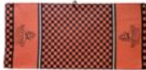
18" X 40" MOQ=36 (6pcs/color)