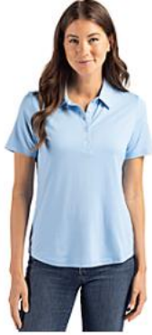
Cutter & Buck Coastline Epic Comfort Recycled Womens Polo LCK00192