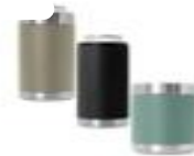
Can Coolers & Food Containers

Custom tumblers can include an etched logo. Minimum order is 24 pieces. Price starts as low as $20 per item.