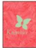
16" X 21" MOQ=48 (9pcs/color)