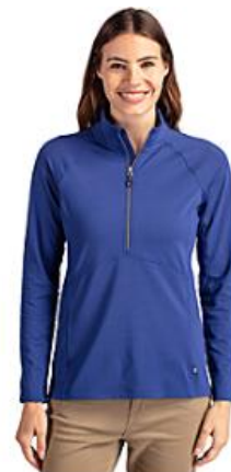
Cutter & Buck Adapt Eco Knit Stretch Recycled Womens Half Zip Pullover LCK00128