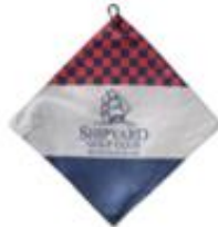
18" x 18" MOQ=48 (9pcs/color)