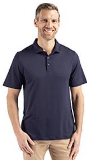
Cutter & Buck Coastline Epic Comfort Recycled Mens Polo MCK01327