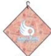
16" x 16" MOQ=48 (9pcs/color)