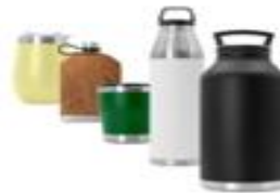
Beer, Wine, & Spirits