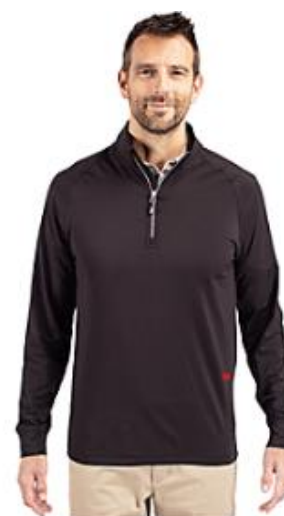
Cutter & Buck Adapt Eco Knit Stretch Recycled Mens Quarter Zip Pullover MCK01143