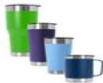
Tumblers & Mugs