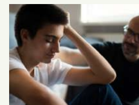
Mentoring dads for success

Men's Life advocates increased their effectiveness by giving support to new dads during their initial visit as they navigated decisions for an unplanned pregnancy.