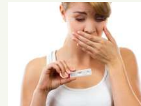
388 pregnancy tests given

Grayslake remodeled to serve the increase in clients!