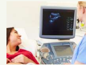
# of sonographers doubled