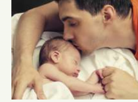
Helping families grow...