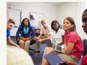
Healthy Choices made 823 presentations in 2017/18!