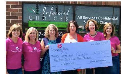
Thank you to Community Purse for awarding IC a $13,300 grant!