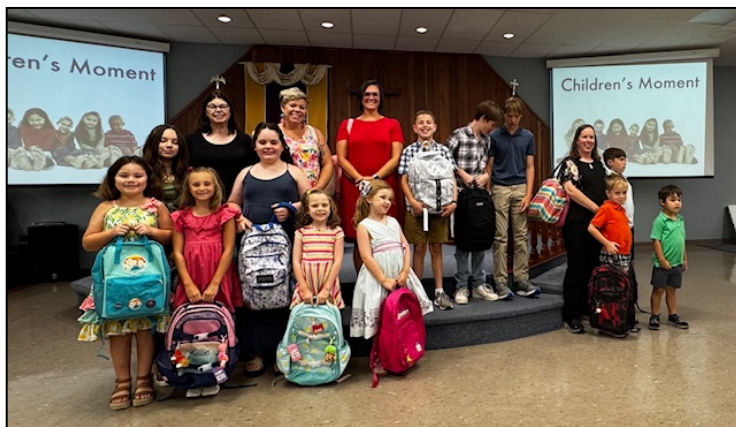
Blessing of the backpacks on August 3, 2025.

There are many ways – big and small – that you can show up and support children and families.