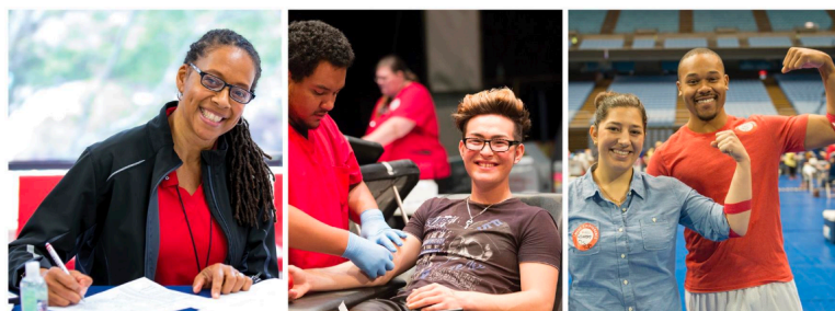
Warren County Community / 1 st United Methodist – McMinnville, TN