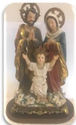
2 nd Prize

1 st Prize: Silver St. Jude (Value $2,000)