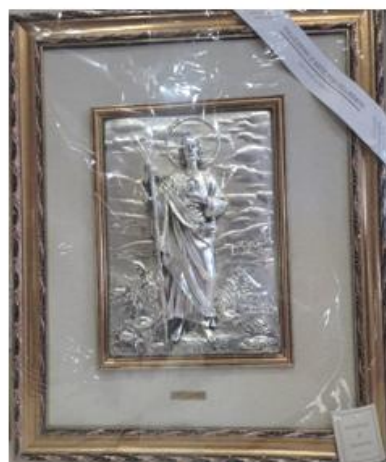
1 st Prize