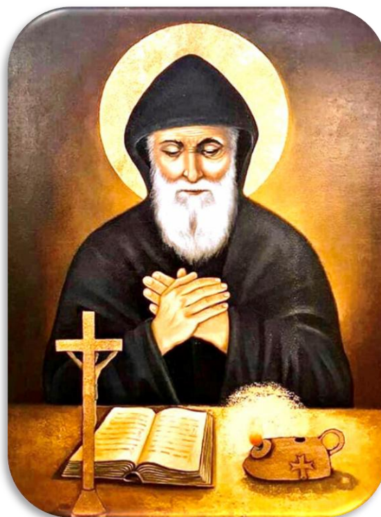
MIRACULOUS PRAYER TO SAINT CHARBEL MAKHOUF - WONDER- WORKER MONK OF THE EAST (Known as the Padre Pio of Lebanon)