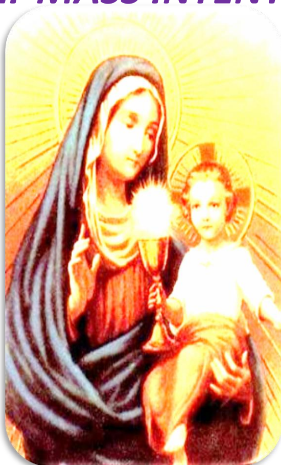
Pray for Healing of the Sick