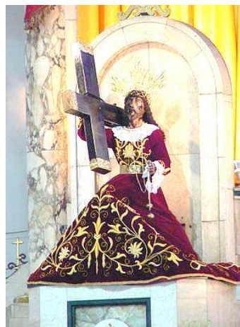
The Original Miraculous Image of the Black Nazarene in Quiapo, Manila