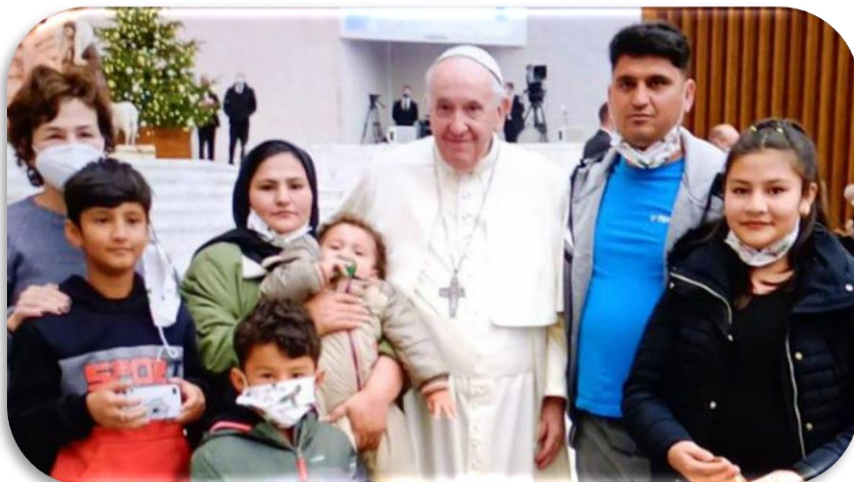
Pope Francis meets with Afghan child cared for by Bambino Gesù Hospital and family

Thanks to the efforts of the Sant'Egidio Community, the child who is in need of medical care, was flown to Rome with his family and is undergoing treatment at the Vatican's Paediatric Bambino Gesù Hospital. The child, from Afghanistan, and his family were amongst the many gathered at the Mavrovouni refugee camp on the island of Lesbos to welcome Pope Francis on the morning of 5 December. On that occasion the Pope issued an appeal for coordinated actions to remove the root causes of poverty, underlining that migration is a humanitarian crisis that concerns everyone.