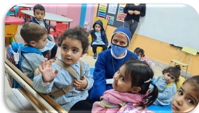
School children at the Catholic school of Beit Hebbak, in Lebanon