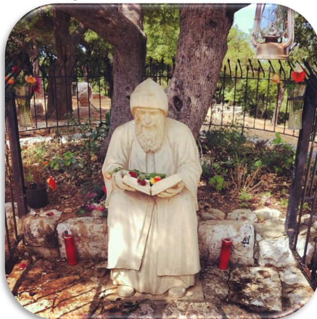
Statue of St. Sharbel praying the Bible in Annaya, Lebanon

The following day, he was healed. He visited the convent of Saint Maroun in Annaya and he got his healing registered on April 14, 2011.