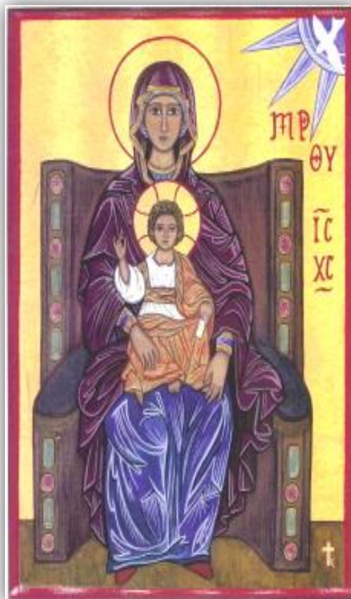
Healing of the Sick