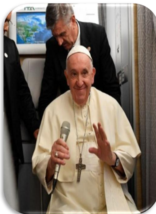
Pope on return flight from Canada

St. John Paul the II was the first Pope to visit Kazakhstan , 22-25 September 2001, with the motto of "Love one other."