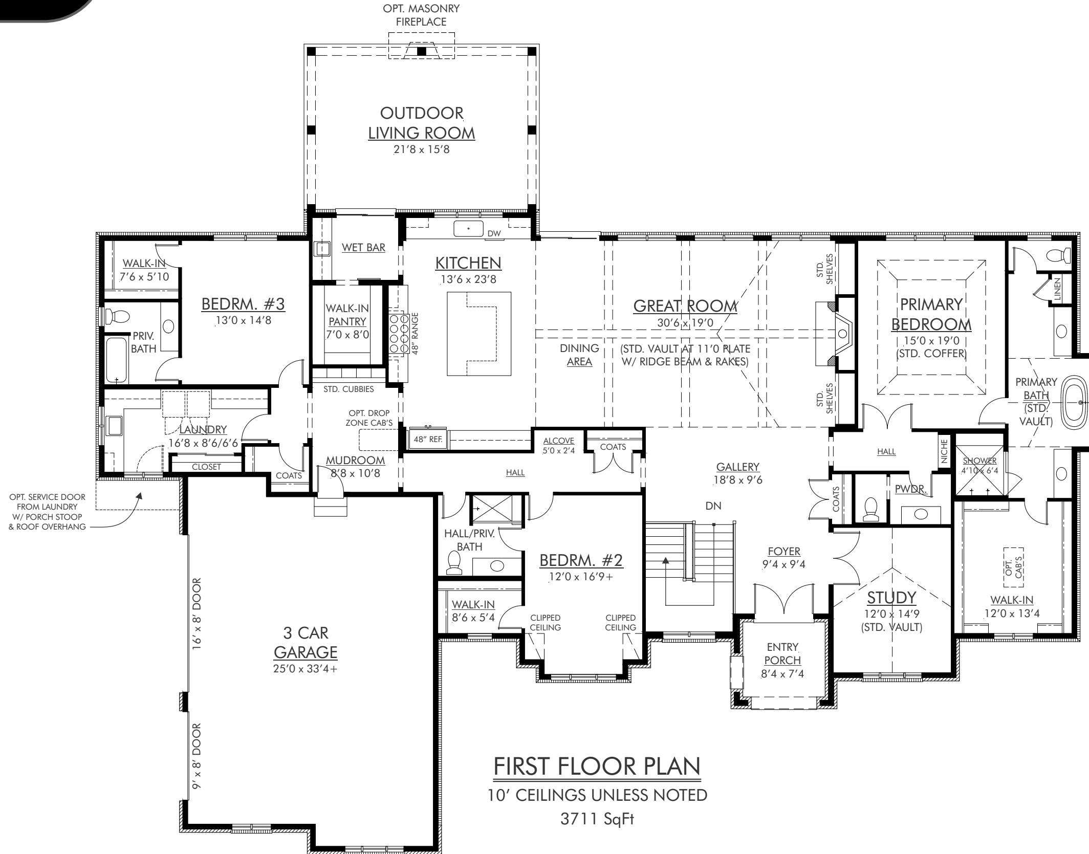
FIRST FLOOR PLAN 10' CEILINGS UNLESS NOTED 3711 SqFt

Disclaimer: plans, elevations, and renderings are an artist's conception intended to serve as a general guide, not to accurately depict the legal description of the property's walls, boundaries, dimensions, scale of rooms, and/or their relative locations. All plans subject to change without notice or obligation. 6/18/26