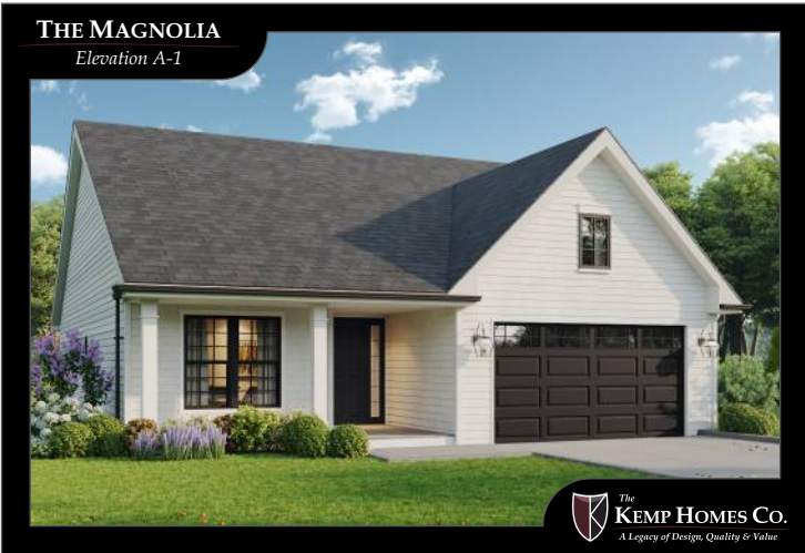
Shown with Optional Garage Door Windows and Optional Black Window Frames