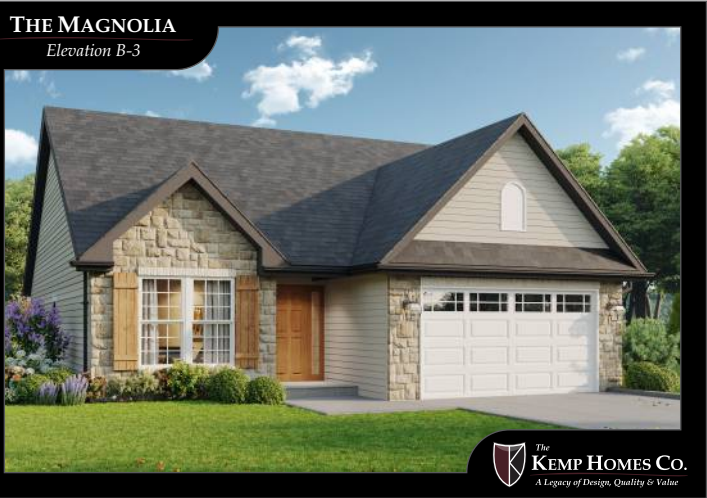
Shown with Optional Garage Door Windows