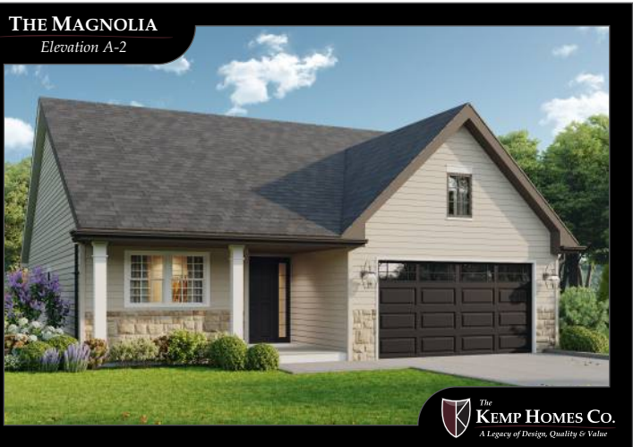
Shown with Optional Garage Door Windows and Optional Black Window Frame Above Garage

For Information Contact: Community Sales Manager Sales Office (636) 265-2646 or visit www.kemphomes.com