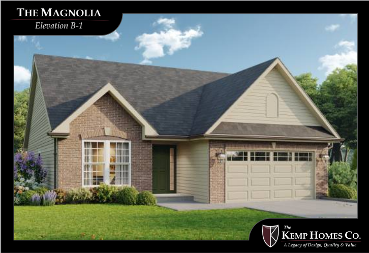
Shown with Optional Garage Door Windows