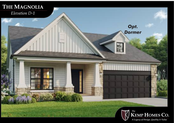
Shown with Optional Dormer Over Garage and Optional Black Window Frames

A principal in the ownership entity is a licensed real estate broker but not involved in any of the brokerage transactions.