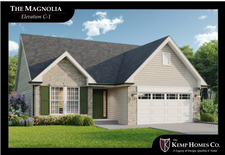
Shown with Optional Garage Door Windows

For Information Contact: Community Sales Manager Sales Office (636) 265-2646 or visit www.kemphomes.com