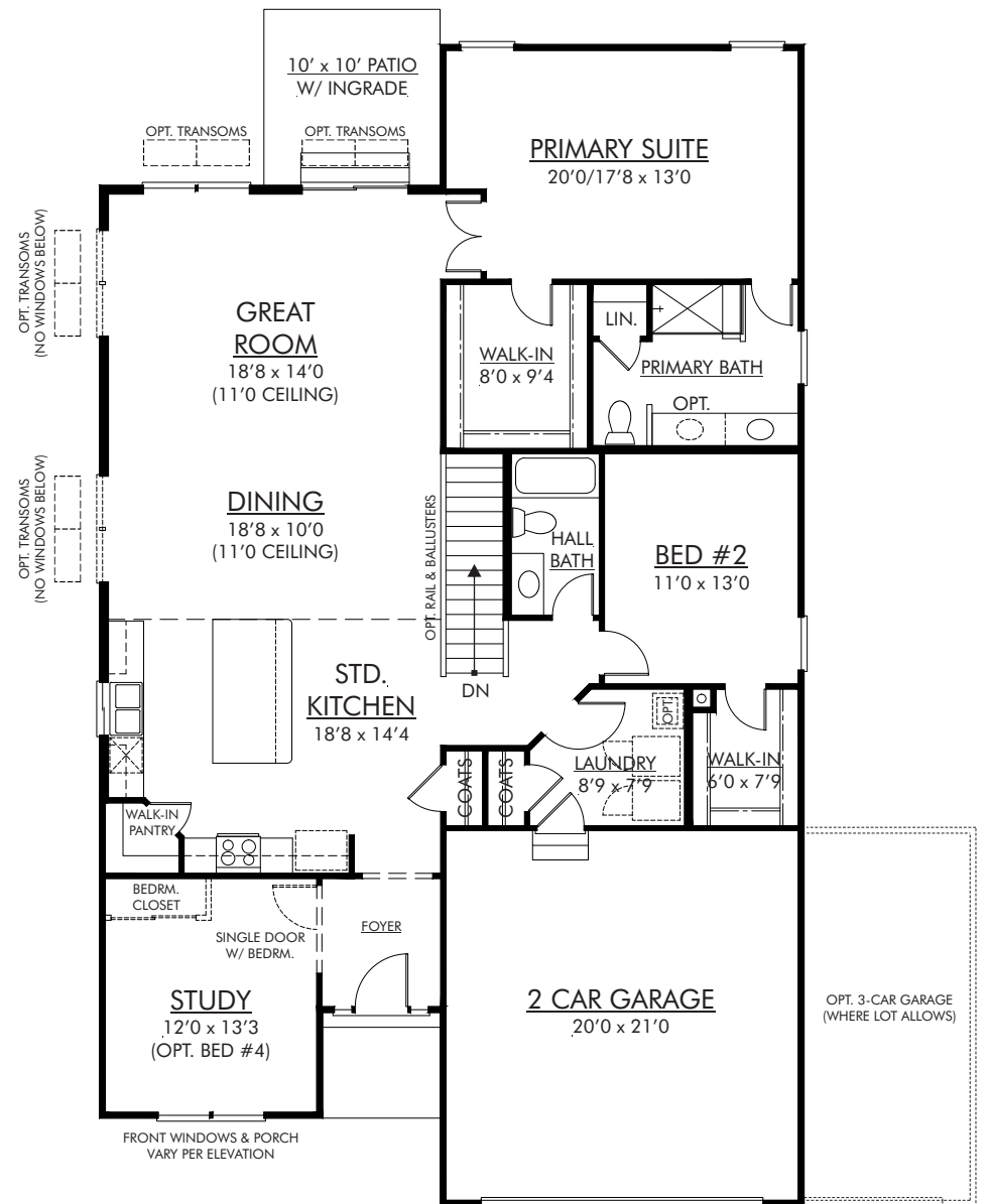
FIRST FLOOR PLAN 1,912 SqFt - DRAWN PER ELEVATION B