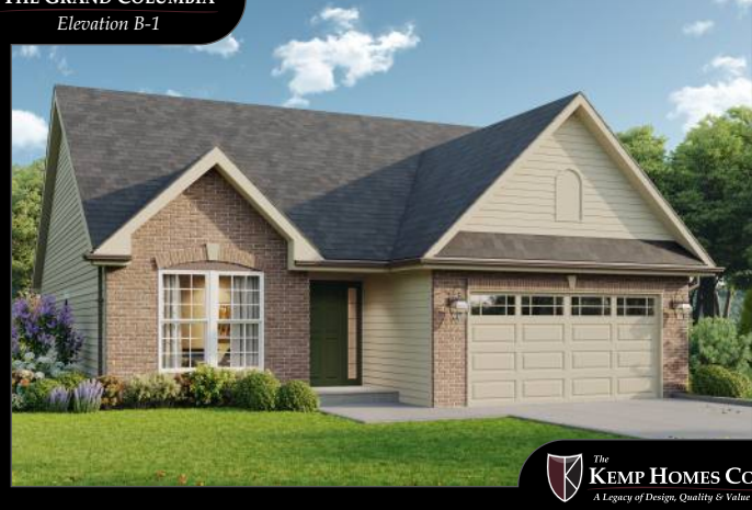
Shown with Optional Garage Door Windows