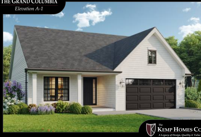
Shown with Optional Garage Door Windows and Optional Black Window Frames