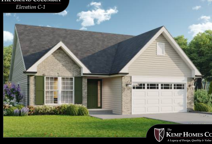
Shown with Optional Garage Door Windows

For Information Contact: Community Sales Manager Sales Office (636) 265-2646 or visit www.kemphomes.com