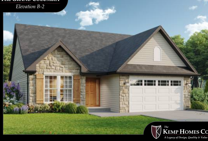
Shown with Optional Garage Door Windows