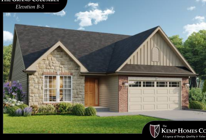
Shown with Optional Garage Door Windows