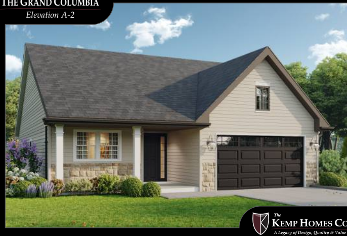
Shown with Optional Garage Door Windows and Optional Black Window Frame Above Garage