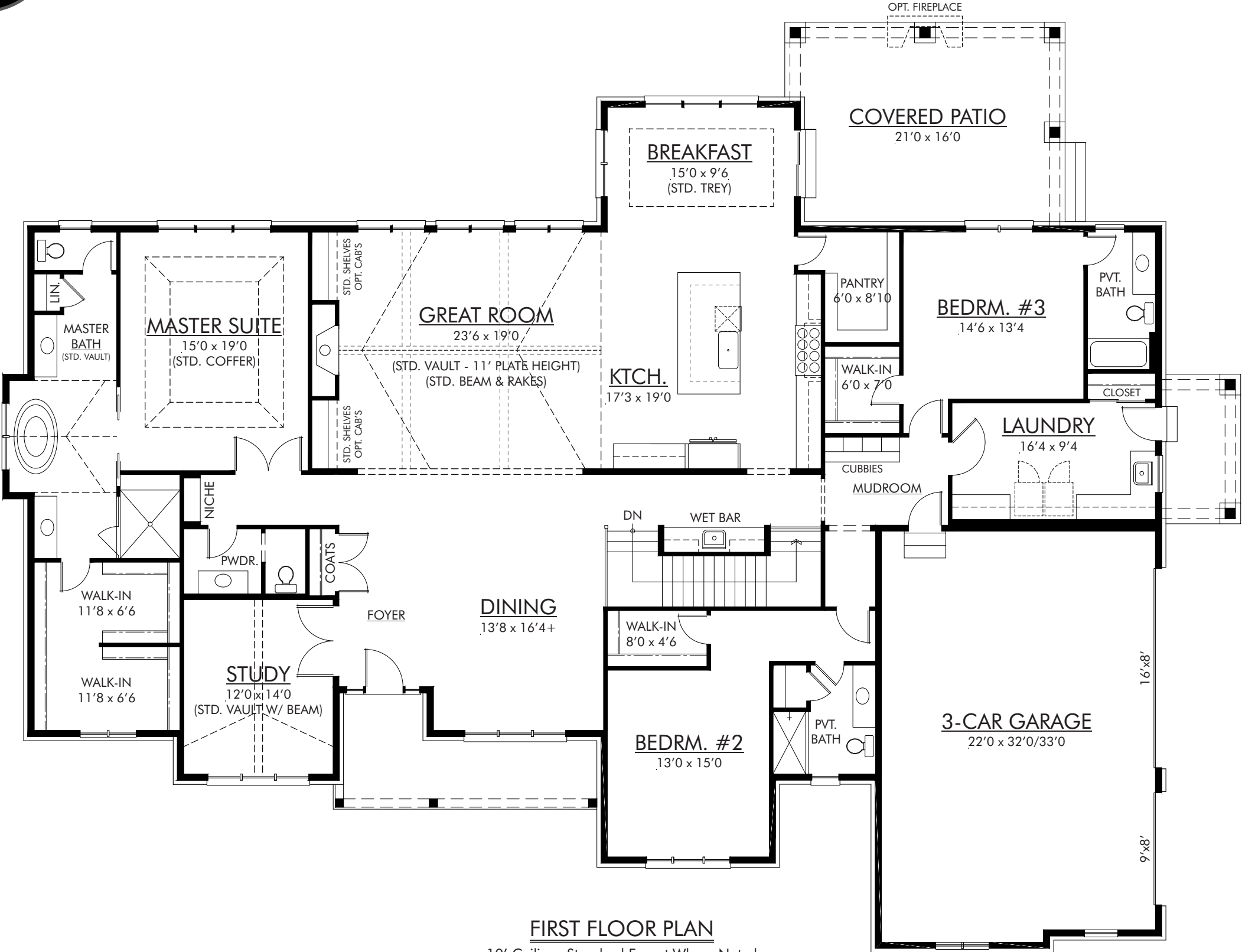
FIRST FLOOR PLAN 10' Ceilings Standard Except Where Noted 3,735 SqFt

Disclaimer: plans, elevations, and renderings are an artist's conception intended to serve as a general guide, not to accurately depict the legal description of the property's walls, boundaries, dimensions, scale of rooms, and/or their relative locations. All plans subject to change without notice or obligation. 8/20/25