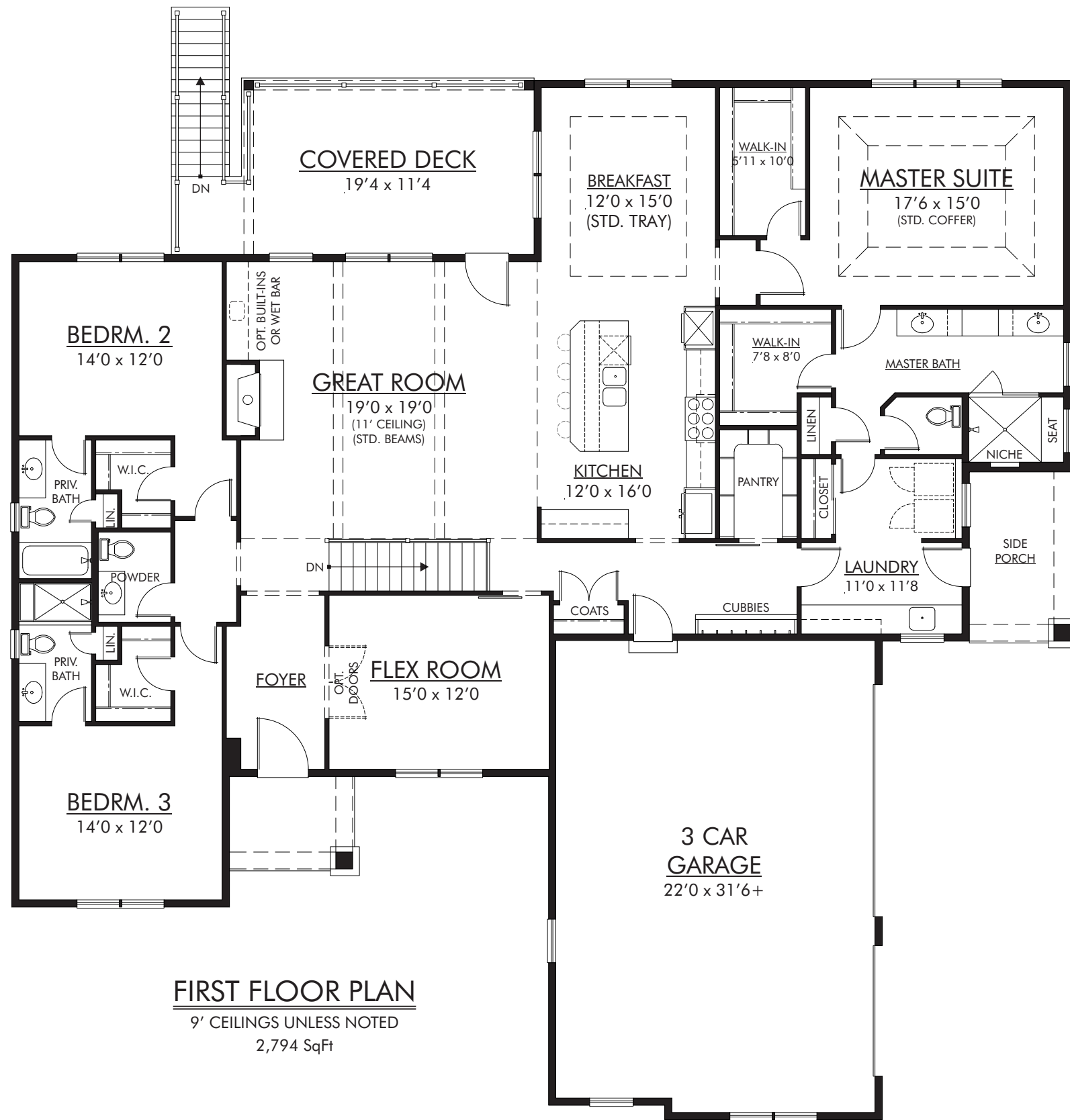
FIRST FLOOR PLAN 9' CEILINGS UNLESS NOTED 2,794 SqFt