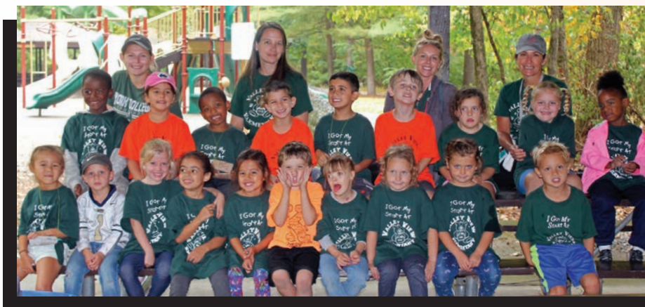
Opposite: The Transformed Classroom at Valley View Elementary. Top: Digitized Arts on iPad with Apple Pencils. Above: Kindergarten Forest School.

This grant provided an outdoor school experience for all kindergarten students that included nature study, team building, problem solving, earth connection, etc. This outdoor classroom experience was held in the fall at Rocky Ridge Park. $3,000.00.