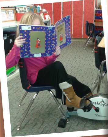
Ditch the Desk