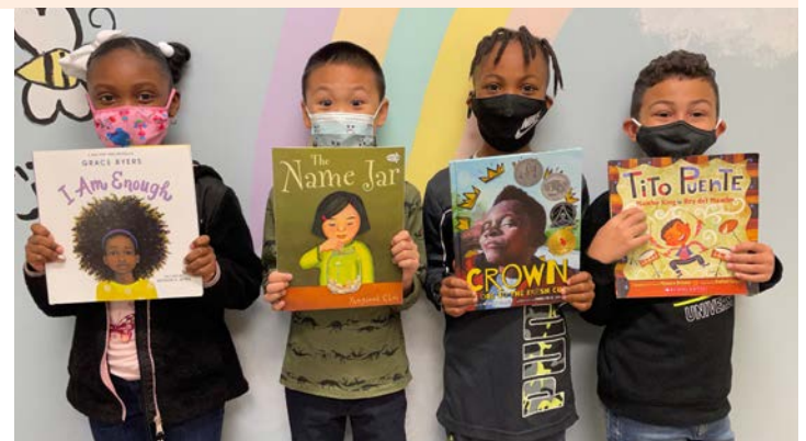
Books as Windows and Mirrors: Building a More Diverse and Inclusive Bookshelf at Valley View.

With the money from this grant, Kindergarten to Second Grade classrooms at Valley View and Yorkshire Elementary receive a set of diverse books (in terms of characters, authors and/or illustrators) which are utilized for read-aloud time. The books facilitate a discussion of community where all children are able to see themselves in the pages of books (mirrors) while embracing the beauty and value of others (windows). $3,500.00.