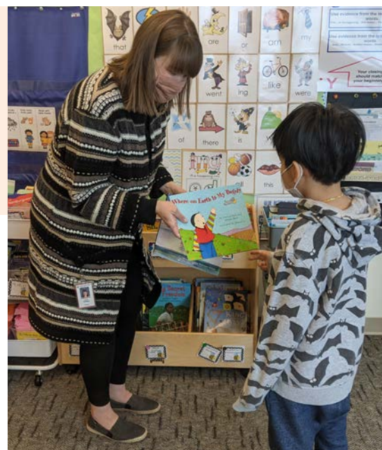
We Need More Diverse Books at Yorkshire.