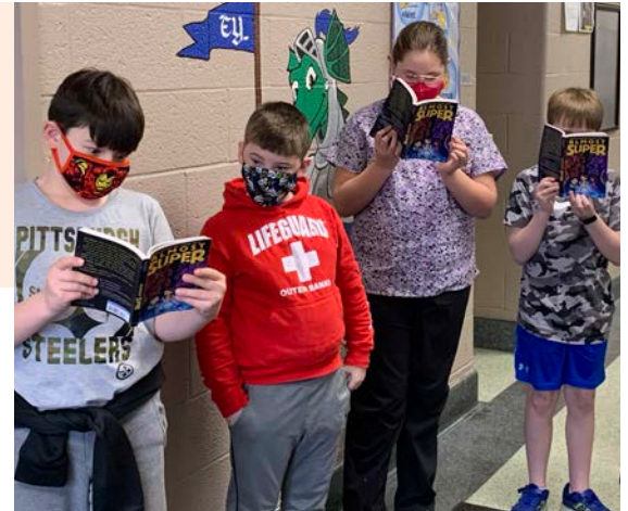
One Book, One School, Building Community, at East York.

With this grant, all students at East York Elementary are given the same book for both the student and their families to read. There are various events centered around the book and even a website to share comments about the book. YSEF has funded this project in the past with much success. $3,500.00.