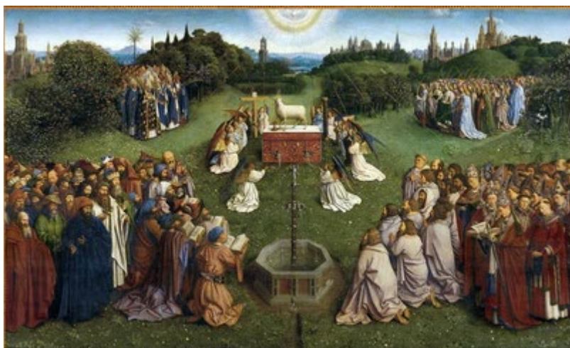
Adoration of the Mystic Lamb by Jan van Eyck