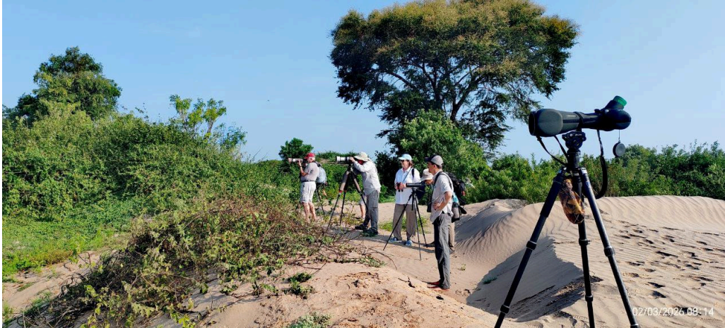
Birding on the Koh Ayey in the Mekong River

Bird List & eBird Link (20 checklists, 253 bird species seen & some vocalized) https://ebird.org/tripreport/483932 .