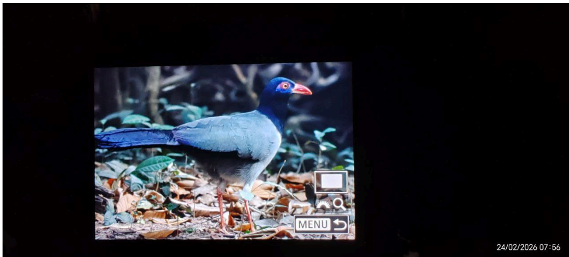
Coral-billed Ground-Cuckoo in the Changkran Roy (CR), CBGC blind

After lunch, we returned to the BBP's blind, then we waited for about 2 hours and 20 min then we left. There is no BBP , but many Asian Emerald Doves, White-rumped Shama, 5 White-crested Laughingthrushes, Siberian Blu Robin, Puff-throated Bulbul, Pin-striped Tit-babbler , and many of the other forest birds. We headed back to Siem Reap at about 3:30 PM.