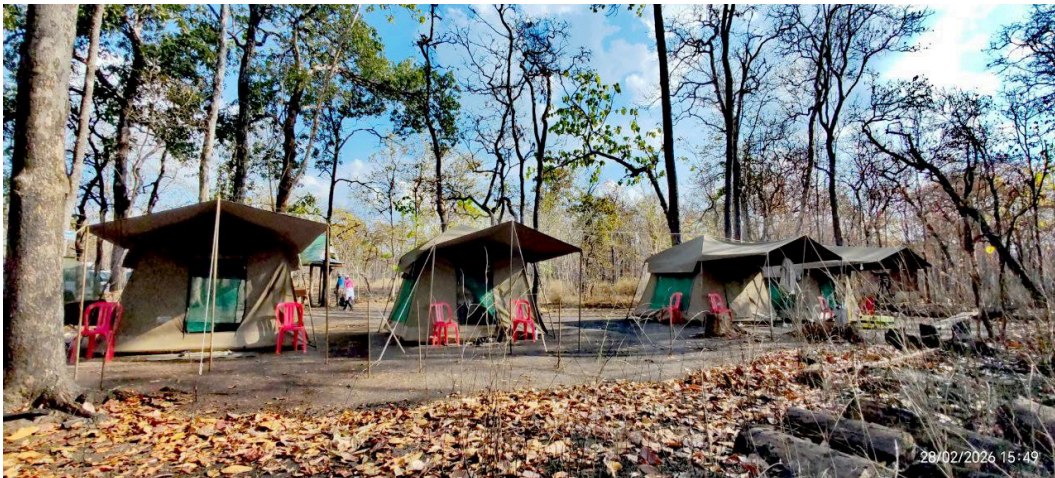
Our campsite in the Beong Toal- Vulture Feeding Station