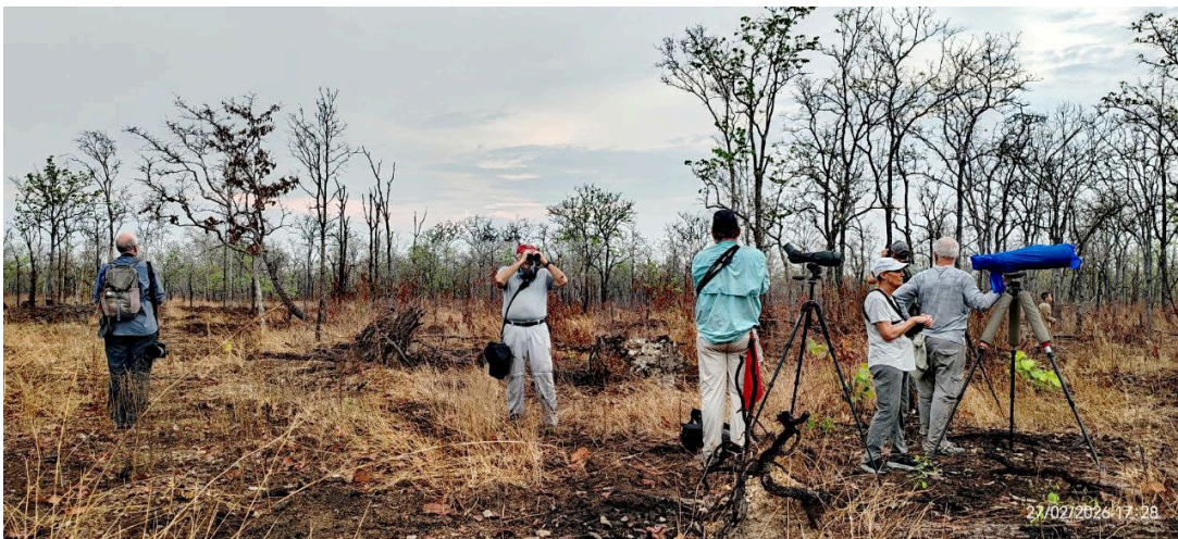
Birding in the Phnom Raeng area

Further deep inside, we flashed 3 Savanna Nightjars from the ground and perched on the fallen branches, we had a great look at them.