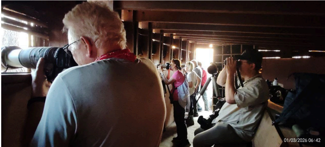
Birding in the Vulture Feeding blind in Beong Toal

We had a wonderful 2 and a half hour birding in the marshland with some good looks at the Pallas's Grasshopper Warblers, Black-browed Reed-warblers, Zitting & Golden-headed Cisticolas pop up on top of the rice, some Grey-headed Swamphens in the shrub in the lake, heard White-browed Crakes, Watercocks, and some Oriental Reed-warblers.