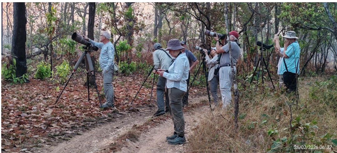
Birding in Trapaeng Chambork, searching for the Giant Ibis

In the afternoon, we went to look for the GI in Trapaeng Kokitraduok , as spotted by one of the local guides, but the GI disappeared after we arrived. We saw some of the other good birds in this spot, and a Brown Fish-owl perched up above the nesting hole.