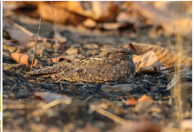
Rufous-bellied Woodpecker and Savanna Nightjar