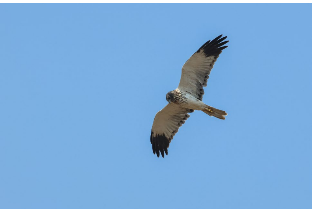
Bengal Florican and Eastern Marsh Harrier