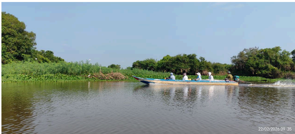
Prek Toal Ramsar Site- Waterbird Breeding Colony

Afterward, we climbed down, got on the boat back to the floating village for lunch, and headed back to Siem Reap .