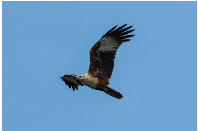
Black-crowned Night Heron and Brahminy Kite