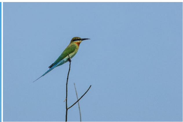
Mekong Wagtail and Blue-tailed Bee-Eater