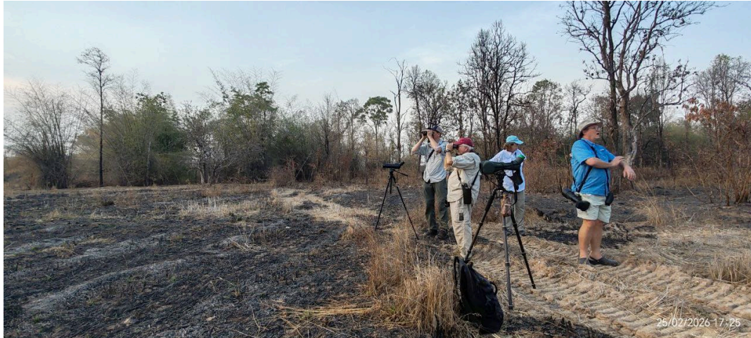
Birding in Chamres Trach for the WSI roosting

We went to Chomres Trach areas to look for the White-shouldered Ibis in the roost, at least a bird came to roost with 3 followers of the Asian Woolly-necked Storks , and another 5 more of WSI came in just before sunset. Then we turn back to the lodge for refreshment, and for a night, we have had a good day today.