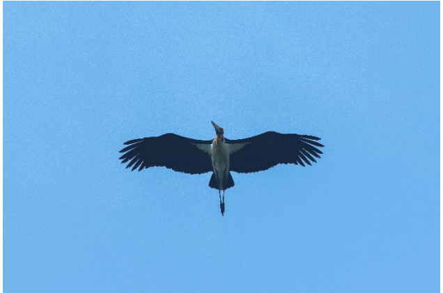
Forest Wagtail and Lesser Adjutant