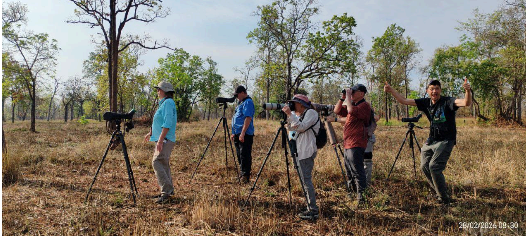
We spotted 2 GIs somewhere near the Srah Teok area.