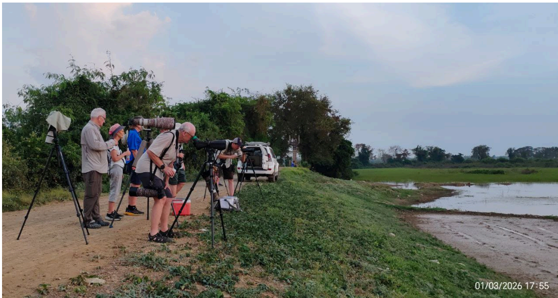
Birding in the Kratie Marshland after we arrived