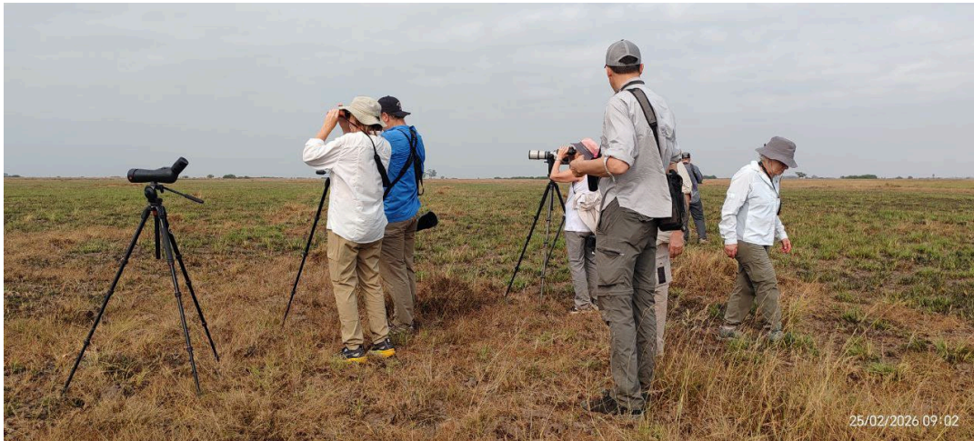
Ang Trapaeng Thmor Protected Landscape (ATT), Sarus Crane Reserve

After lunch, we went to check Thnal Toteong for the Knob-billed Duck , then we headed back to Siem Reap via the Large & Lyle's Fruit-bats Colony in the center of town, and then went to the hotel.