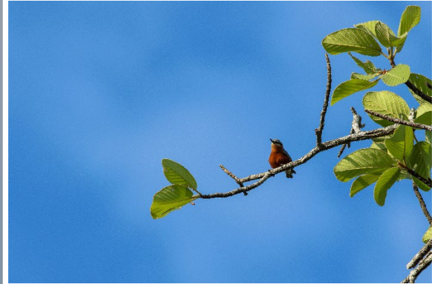
White-shouldered Ibis and Burmese Nuthatch