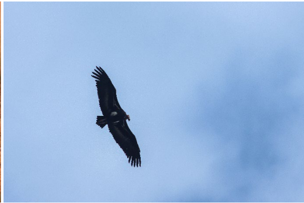
Asian Golden Jackal and Red-headed Vulture