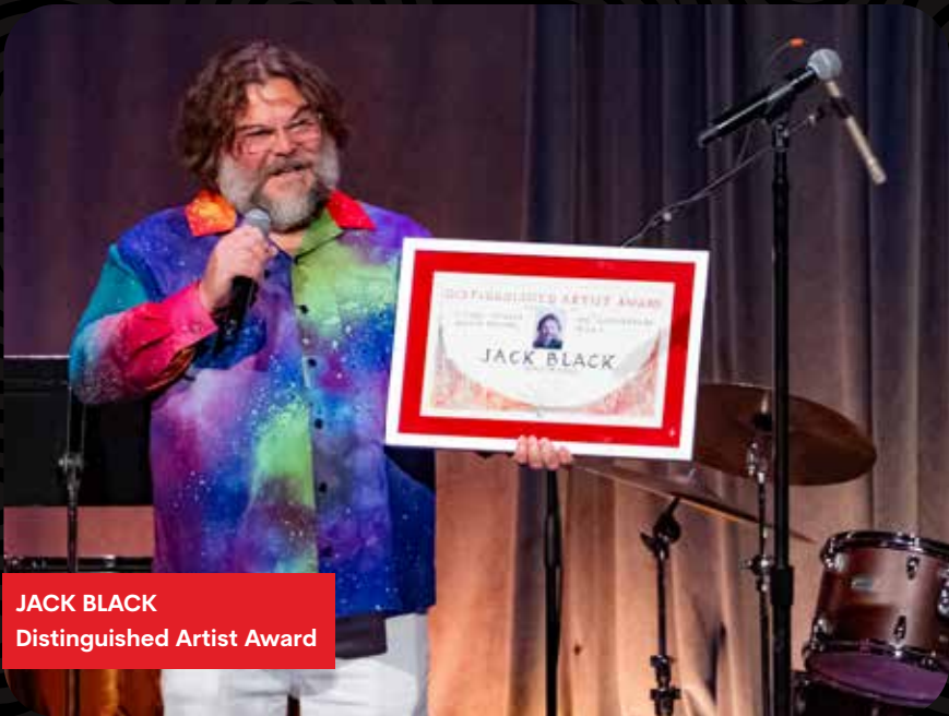
JACK BLACK Distinguished Artist Award