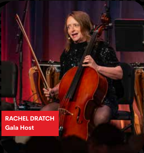
RACHEL DRATCH Gala Host