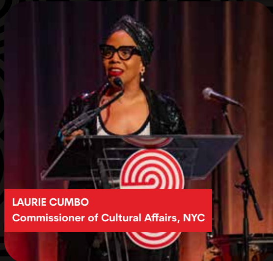
LAURIE CUMBO Commissioner of Cultural Affairs, NYC