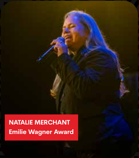
NATALIE MERCHANT Emilie Wagner Award