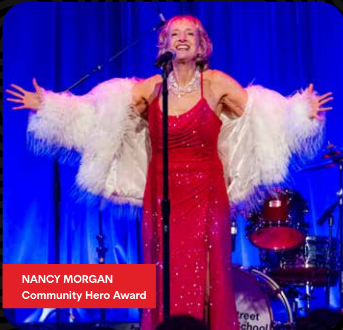
NANCY MORGAN Community Hero Award