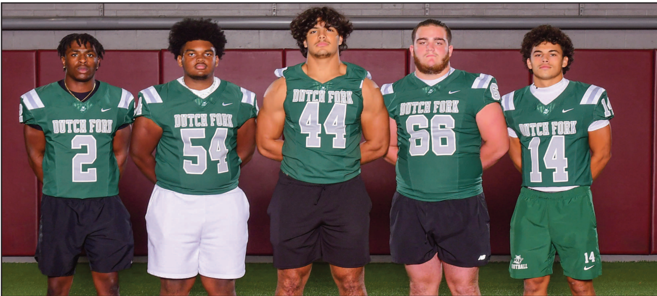
2025 Dutch Fork Silver Foxes football standouts