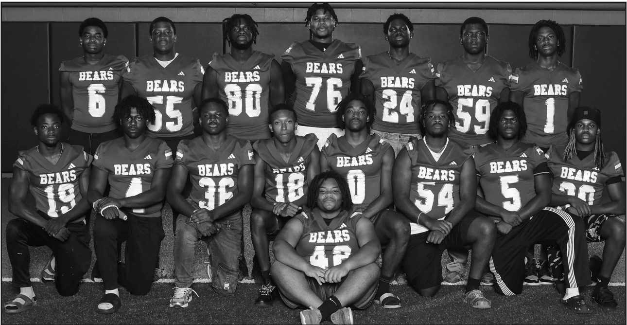
Carver’s Bay Bears

will work hard to keep the Wild Gator winning tradition alive. (Please feature story on the team elsewhere in this issue). Lake View began the season on August, 21 against Marion .