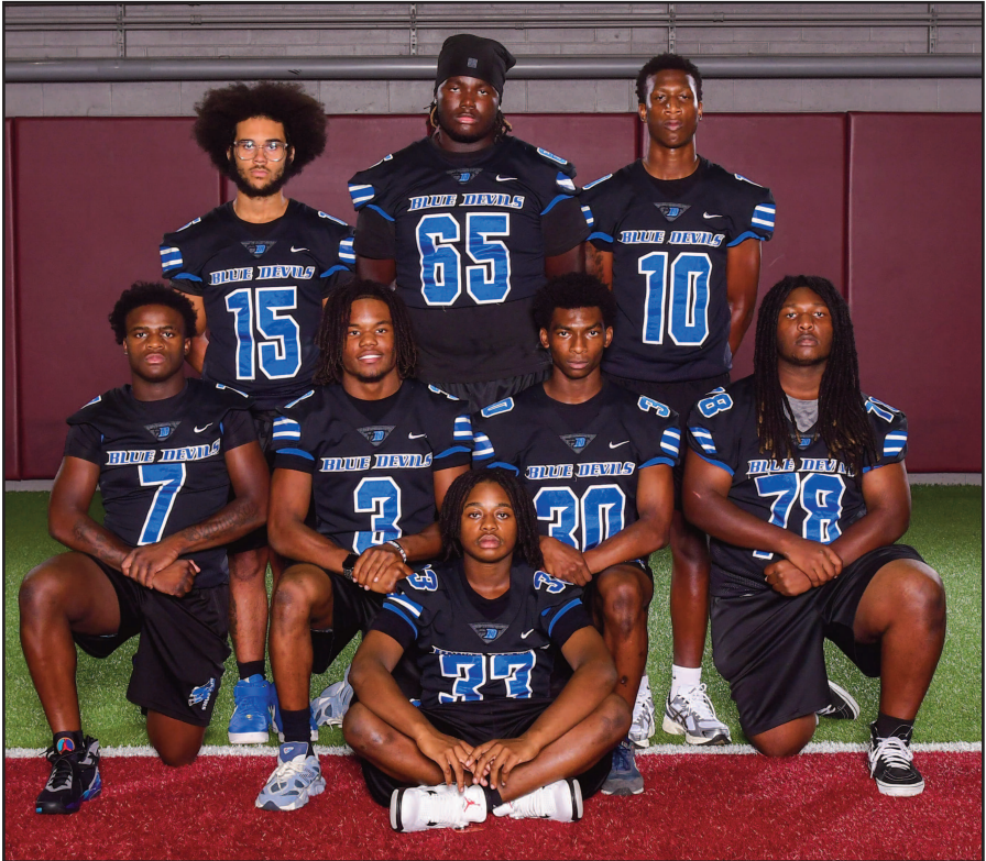
Dreher Blue Devils