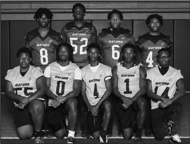
Lake Marion Gators