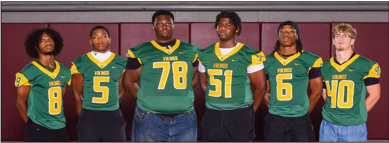
2025 Spring Valley Vikings