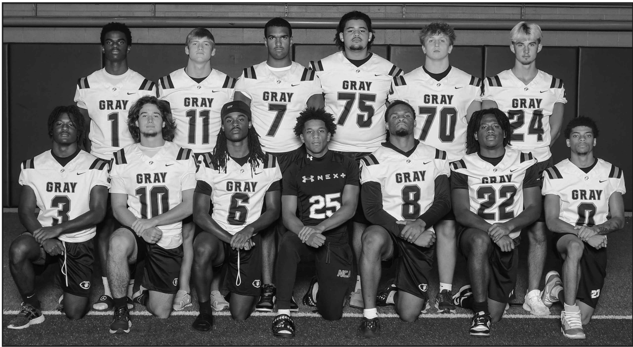
Gray Collegiate War Eagles