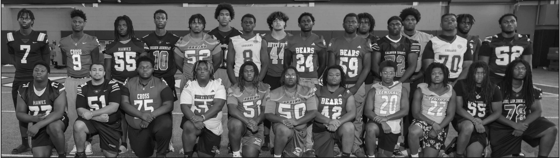
Some of the best 2025 Defensive Linemen in SC