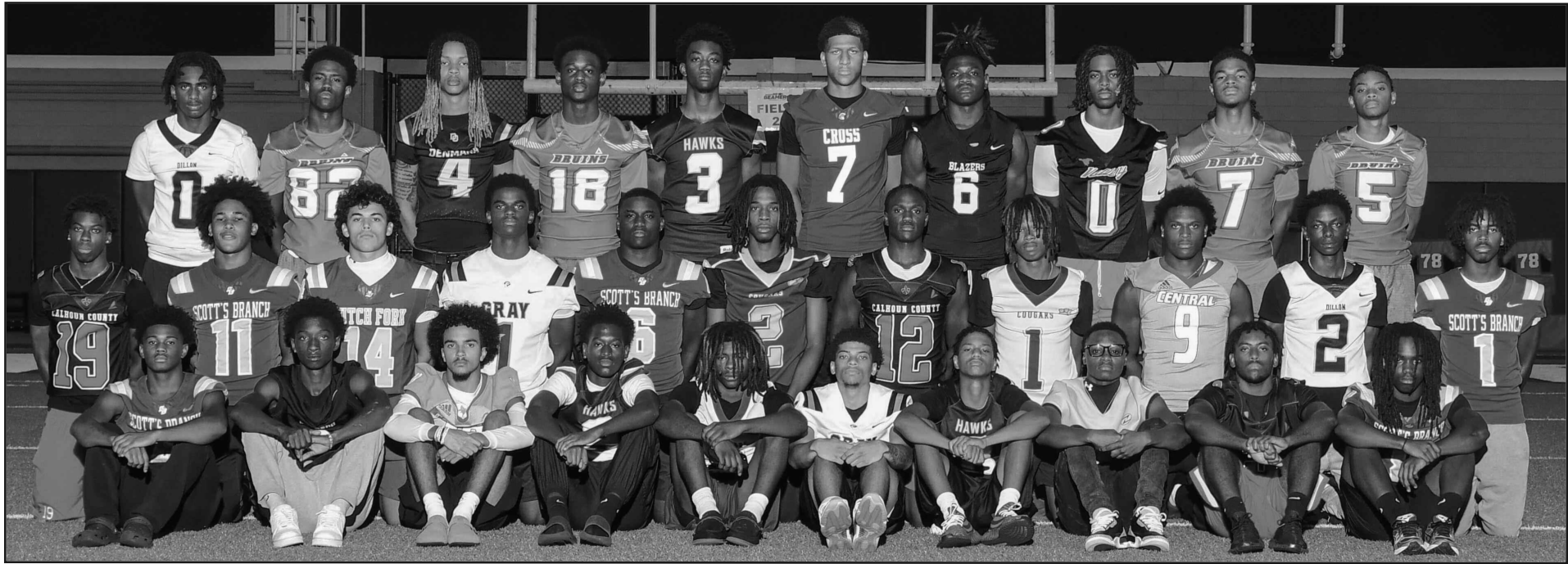
Some of the state's best talent is in the wide receivers group in 2025