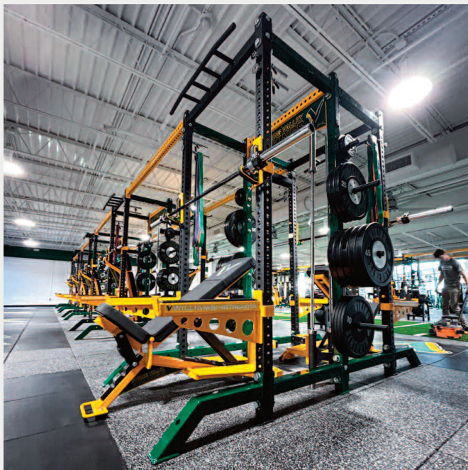
Spring Valley High School