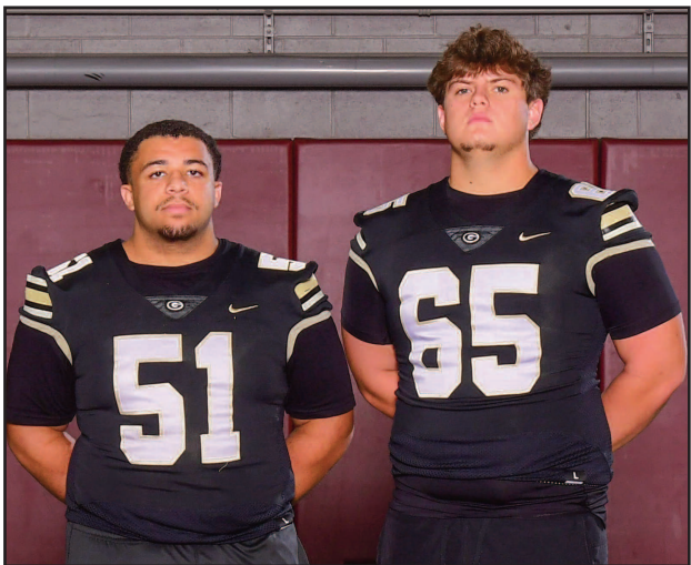
Greer Yellow Jackets