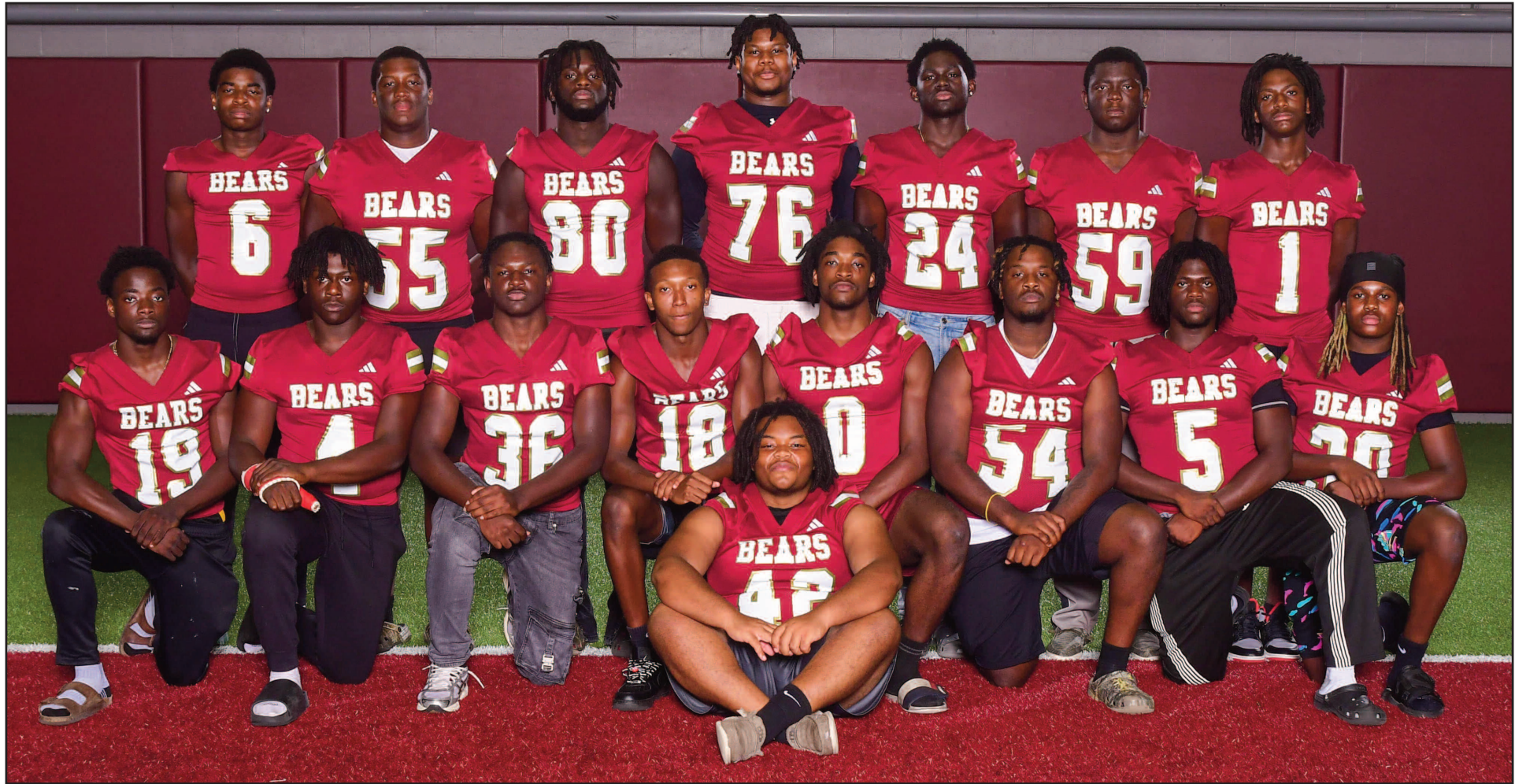
Carvers Bay Bears