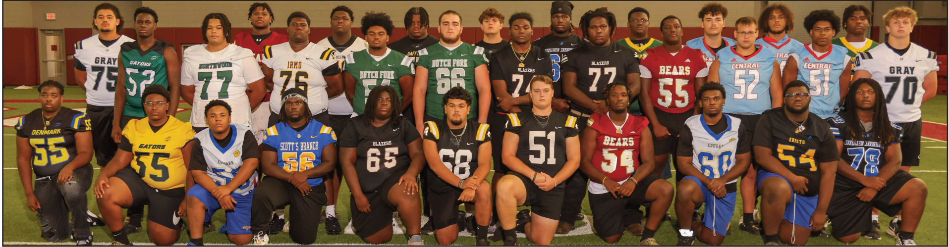
Some of the state's best talent is in the offensive lineman group