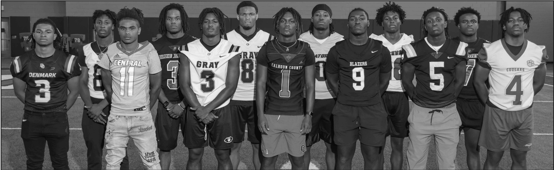
Some of the top running backs across South Carolina