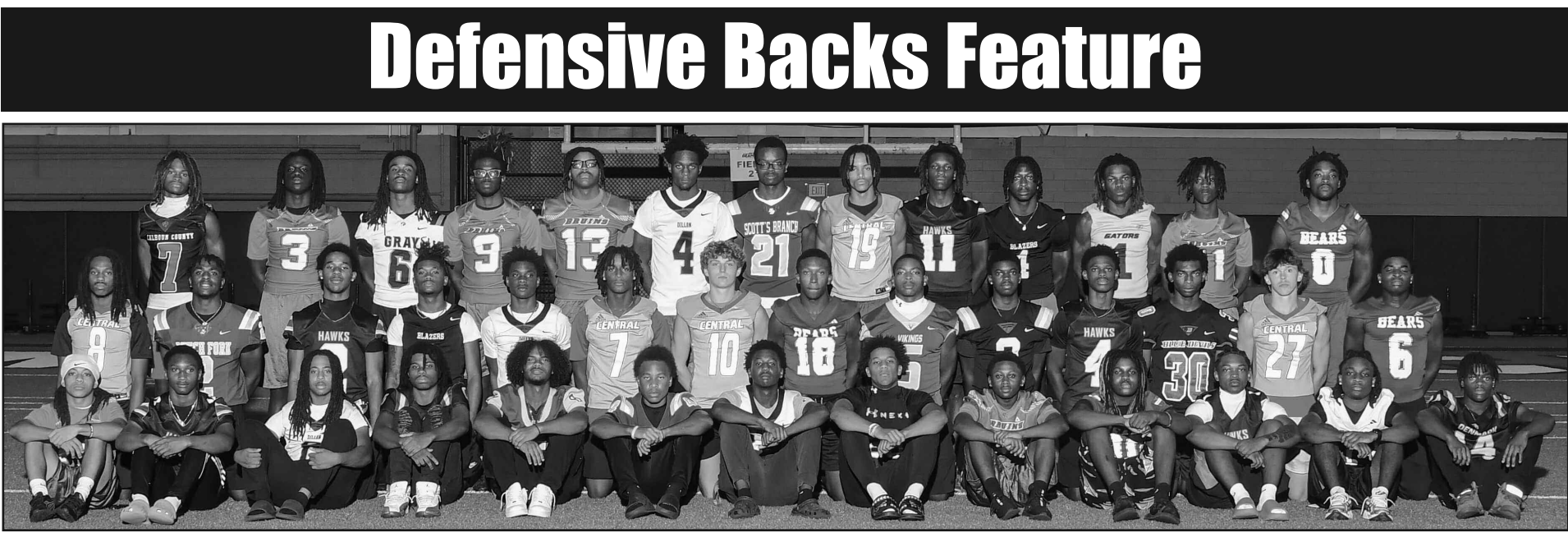
Some of the state's top defensive backs