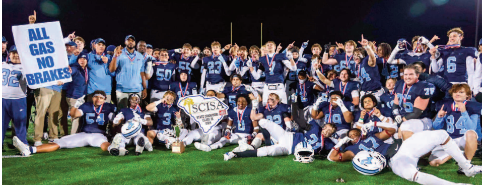
Last season, Pinewood Prep captured the SCISA AAA crown

Patrick Henry Academy (4-7) and Andrew Jackson Academy (1-8) will work hard to be com-