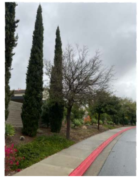
Quercus virginiana was down for removal, this is a before photo

Consult with one of our Urban Forestry Experts to identify whether or not this tool will be useful for the trees on your property, and why.