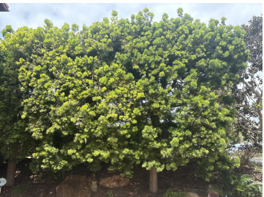
Afrocarpus hedge after