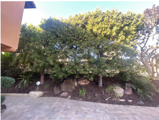
Afrocarpus hedge before