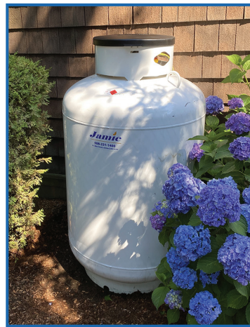
Modern 120 gallon propane tank

You need to be able to adapt. In the 1920's and 30's, the smart blacksmiths began selling gasoline and repairing automobiles. The children of those blacksmiths learned how to fix foreign cars in the 70's if they wanted to stay in business. Those who failed to adapt fell by the wayside. The Blacksmiths