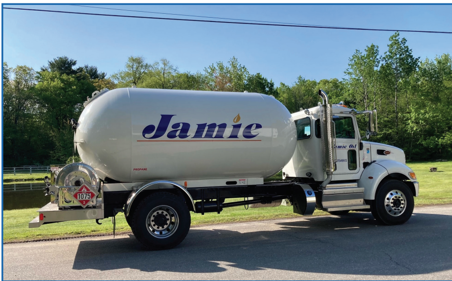
A JOC "bobtail" which offers modern economical and safe delivery of propane.

When I asked my dad what innovation most improved life for him and his customers, he said "A truck with a transmission can shift into reverse... horses, wagons and sleighs can't. Delivery by truck was faster, more reliable, and more economical, just what the customers wanted most." Some things don't change.