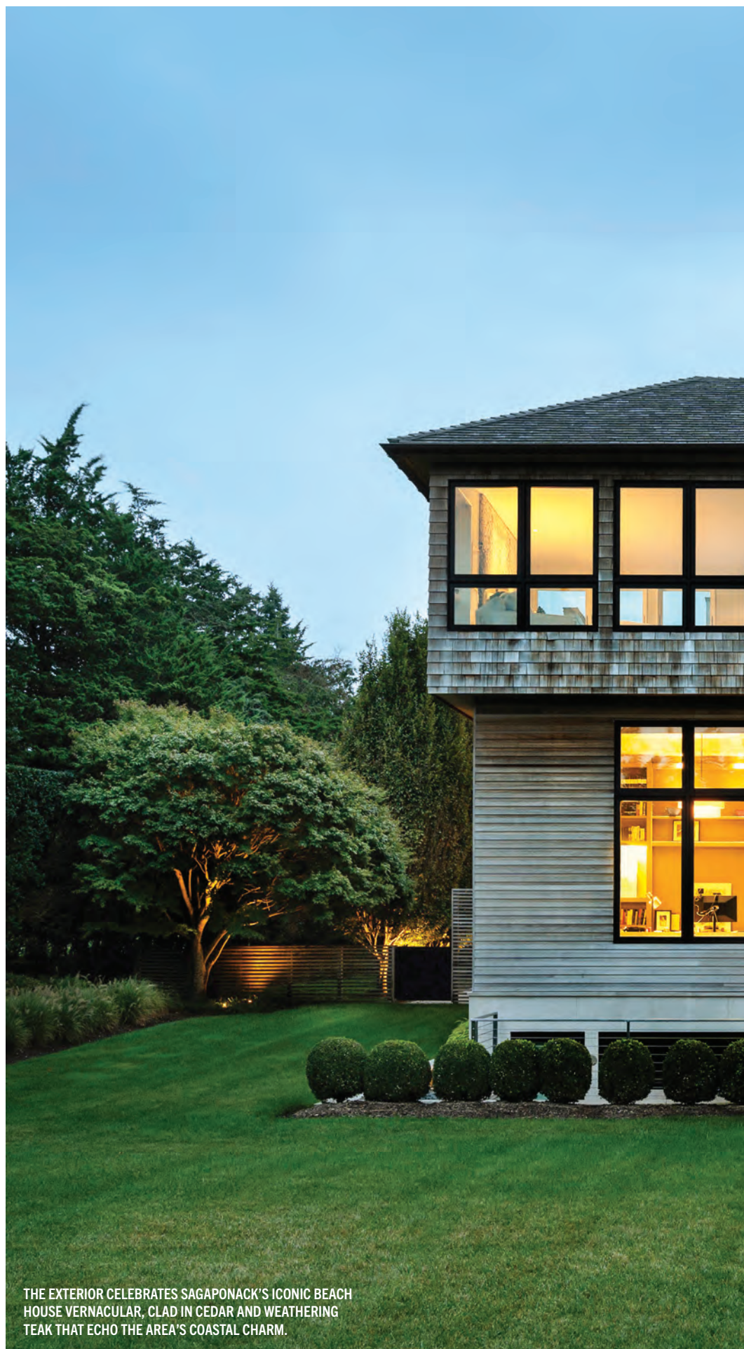
THE EXTERIOR CELEBRATES SAGAPONACK'S ICONIC BEACH HOUSE VERNACULAR, CLAD IN CEDAR AND WEATHERING TEAK THAT ECHO THE AREA'S COASTAL CHARM.