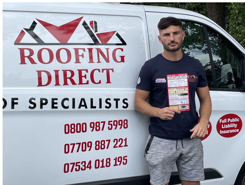
ROOFING DIRECT EMERGENCY REPAIRS – 10 YEARS+ ADVERTISER

Home and business owners 'keep' the card because they know one day they may need your services, they trust the card and they trust the trades on the card – because we carefully select them. We have selected you on the basis of your qualifications, experience and reviews.