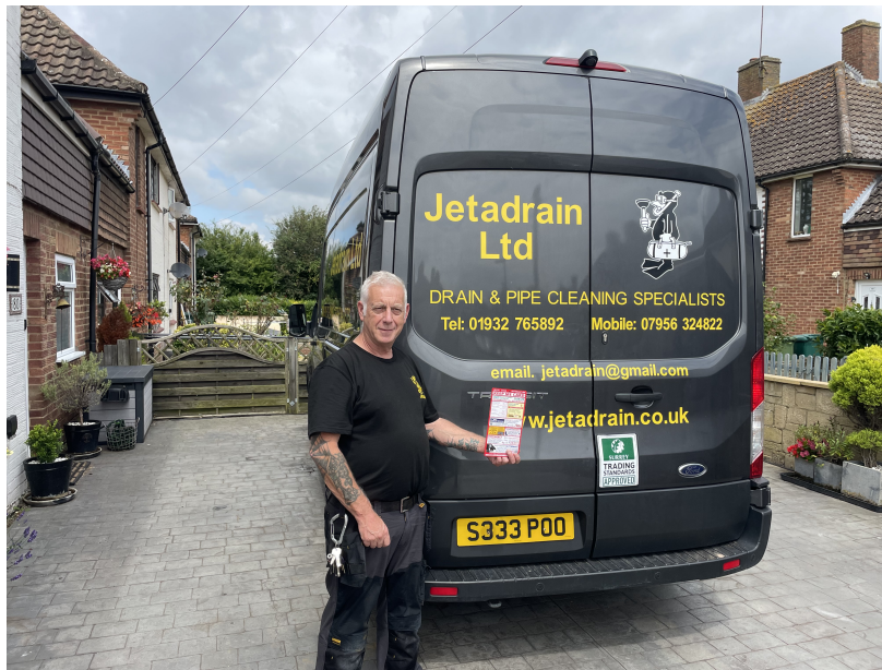
JETADRAIN A 20+ YEAR ADVERTISER

We understand that from time to time disputes may arise between trades and their customers. In such circumstances, and only if we are asked, we will seek to mediate. If we receive 3 or more complaints we will automatically disqualify any trade from all future card editions.