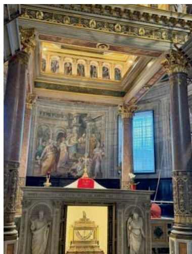
St. Paul outside the Walls, Rome