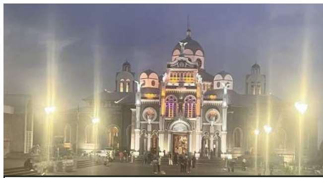
Basilica of Our Lady of the Angels, Costa Rica