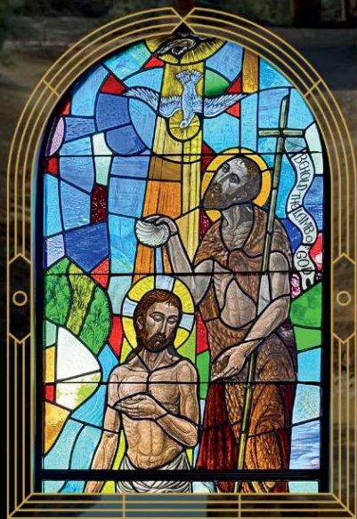
Baptismal site of Jesus Christ in the Jordan River by his cousin, John the Baptist