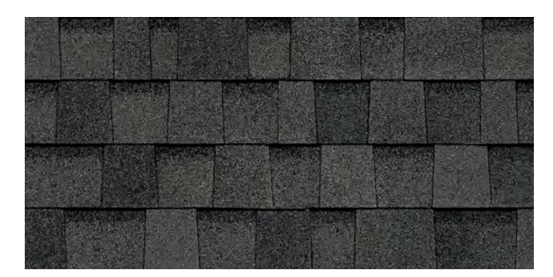
Williamsburg Gray<sup>†</sup> (Not available in service area 8)