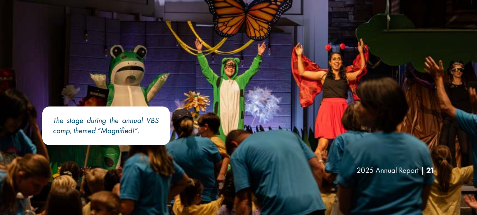
The stage during the annual VBS camp, themed “Magnified!”.