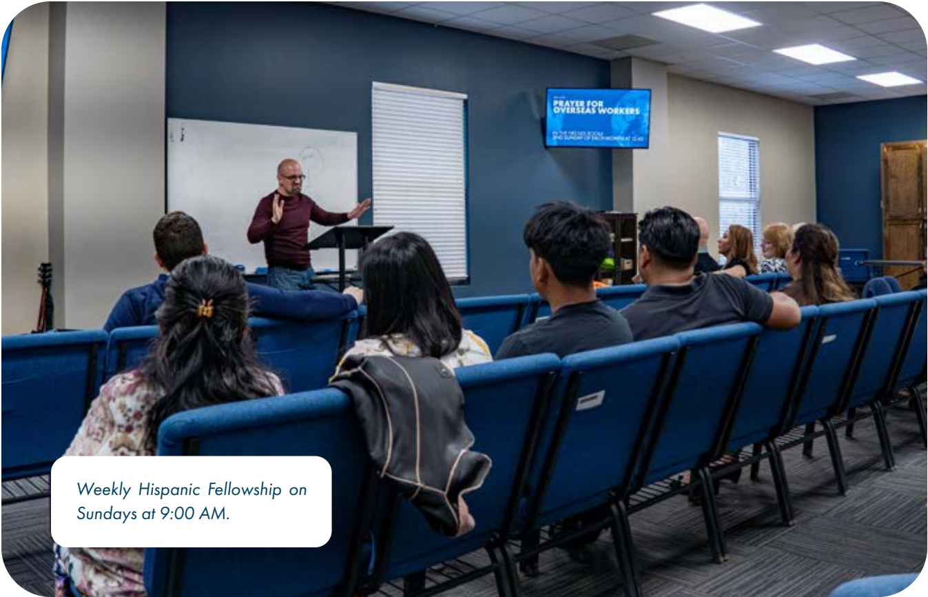
Weekly Hispanic Fellowship on Sundays at 9:00 AM.

We are hoping our ministry will continue to grow this upcoming year, and that we will become more visible within the church family to promote that we are a multicultural church, start plans to add Spanish-speaking counselors to the OD counseling ministry, and faithfully lead our ministry to our only true hope, Jesus Christ.