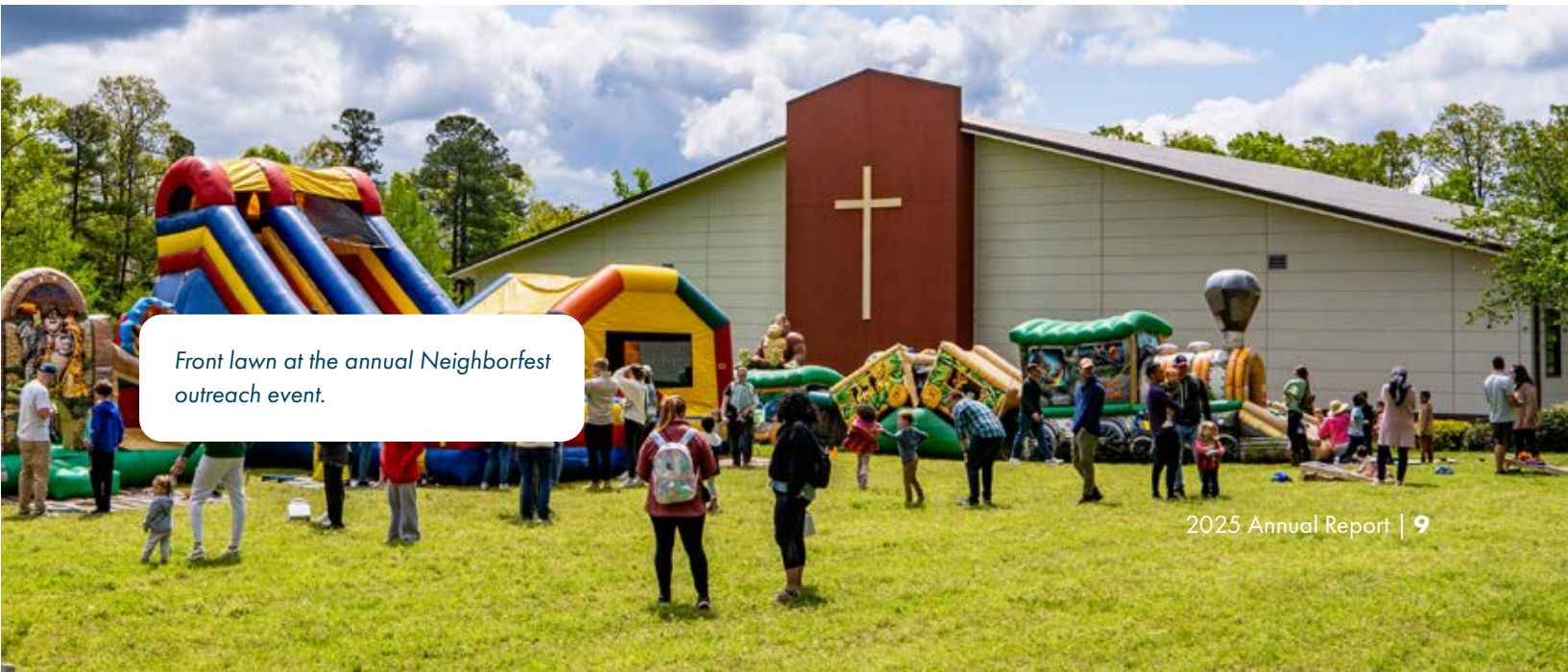
Front lawn at the annual Neighborfest outreach event.