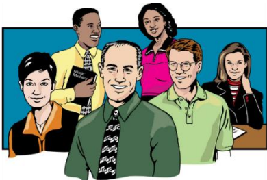
Our Church Elders

To see events happening in the church and Family life center, you can view the Church Calendar via our website, or by clicking the tab below If you have any questions, contact the office at 586-465-0461, or email office@fpcmtclemens.com .