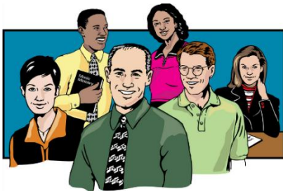
Our Church Elders

To see events happening in the church and Family life center, you can view the Church Calendar via our website. If you have any questions, contact the office at 586-465-0461, or email office@fpcmtclemens.com .