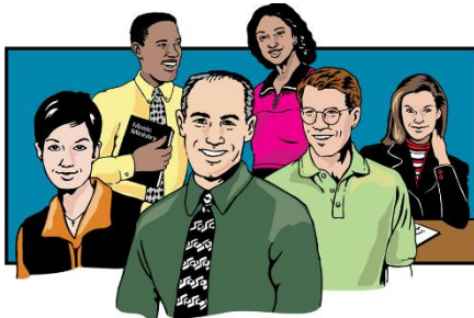
Our Church Elders

Our Free Pantry was built and decorated by our wonderful youth and kids. There is a box located by the north door where you can drop off your donations