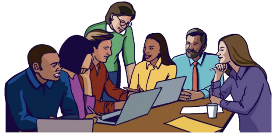
Our Church Deacons