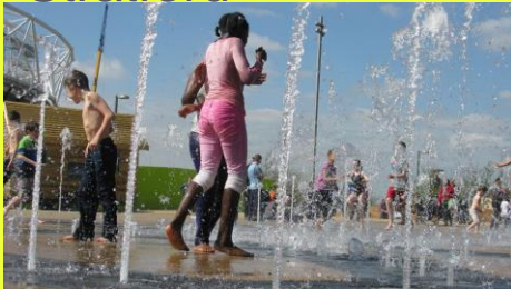
Queen Elizabeth Olympic park - Stratford