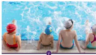
Swim for £1

All sessions will be held in local facilities and venues in and around Redbridge.