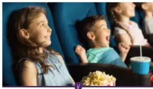
Cinema & Theatre for £1