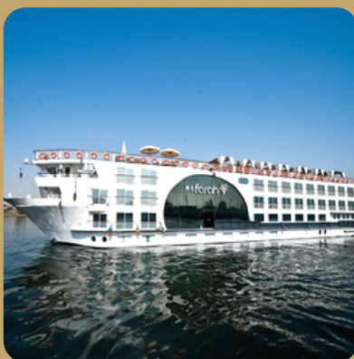
NILE CRUISE M/S Farah Nile