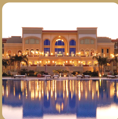
HURGHADA Premier Le Reve