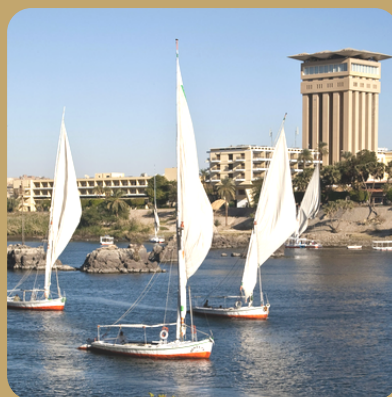
ASWAN Movenpick Aswan