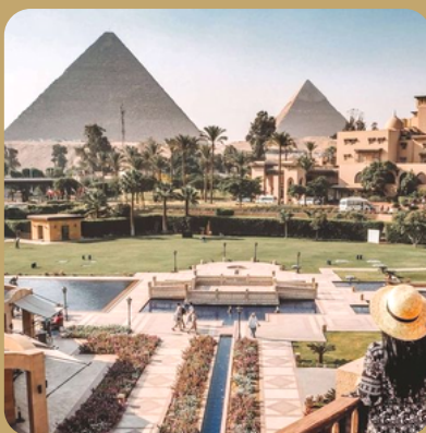
CAIRO Marriott Mena House