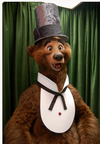
"Henry" country bear mock-up, Walt Disney World, 2011