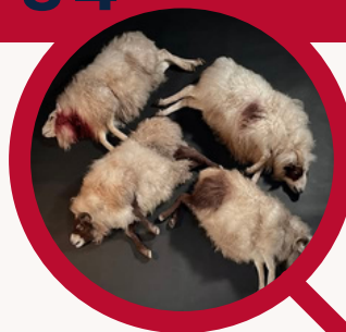
Mauled sheep created for Guillermo Del Toro's FRANKENSTEIN , 2025