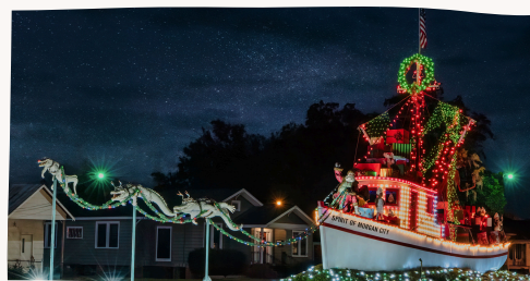
Mardi Gras Jester, personal project, 2023; Five Nights at Freddy's animatronic suits created for SOCKS for a Youtube video, 2024; Cajun Christmas Display, Morgan City, 2024