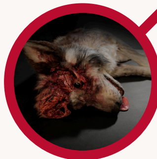
Mauled sled dog created for Guillermo Del Toro's FRANKENSTEIN , 2025