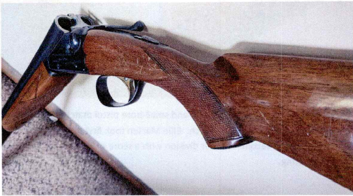
SKB by Ithaca – Model 100 – Side by Side $750.00