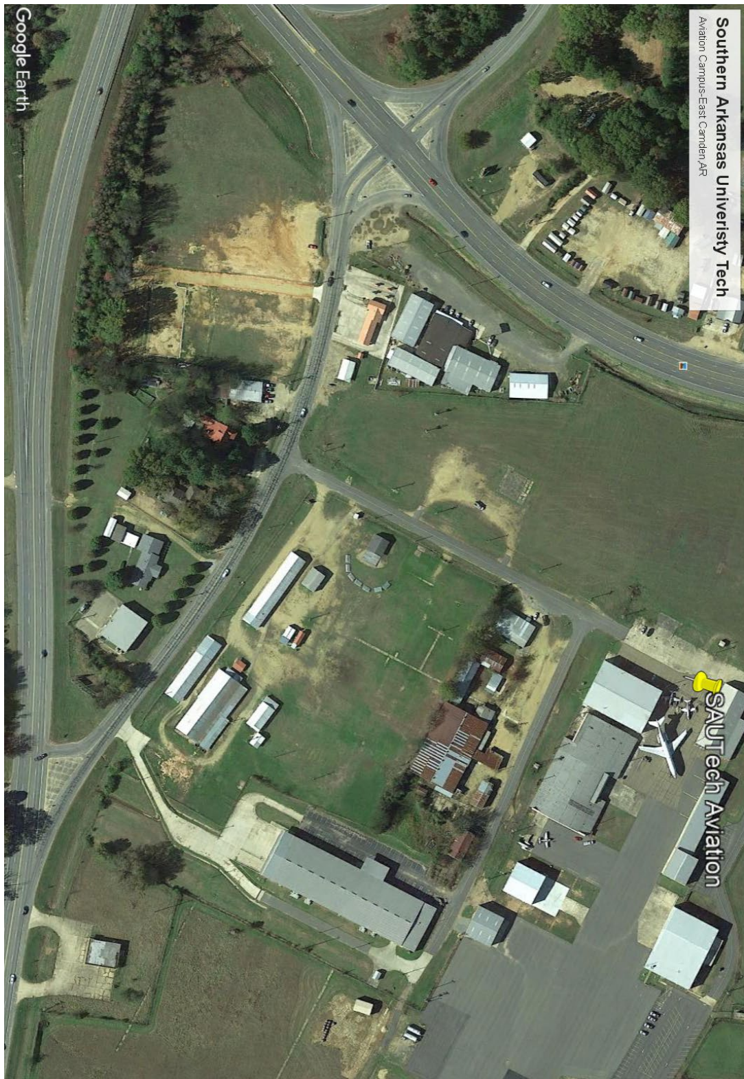
SAU Tech Aviation Hanger East Camden on Hwy US 79