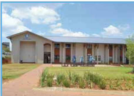
Johannesburg South 2010