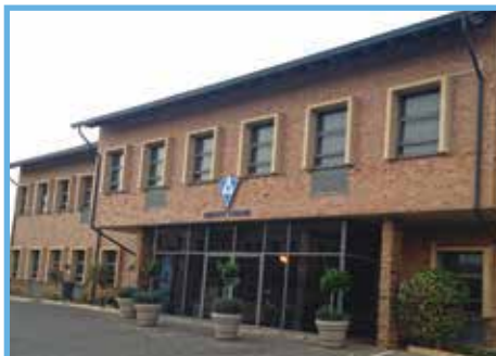
Pretoria East 2006