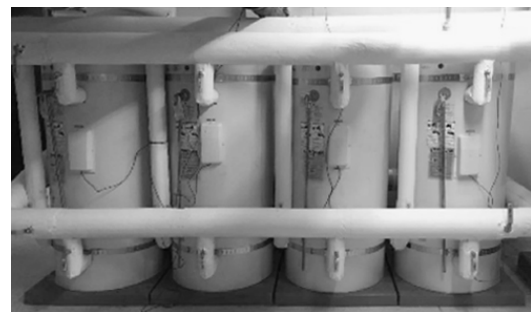
Indoor hot water storage tanks.

C Control Condensate – Both condensate formed on the heat pump coil during summer and ice melted by the heat pump’s defrost mode during winter will need to be safely drained.