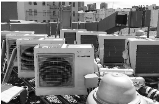
Rooftop air to water heat pumps.

B Install Heat Pump Units – AWHPs can be located outdoors or indoors, if ducting for air intake is also installed. Design of water piping to connect the heat pumps and storage tank must be considered in either case.