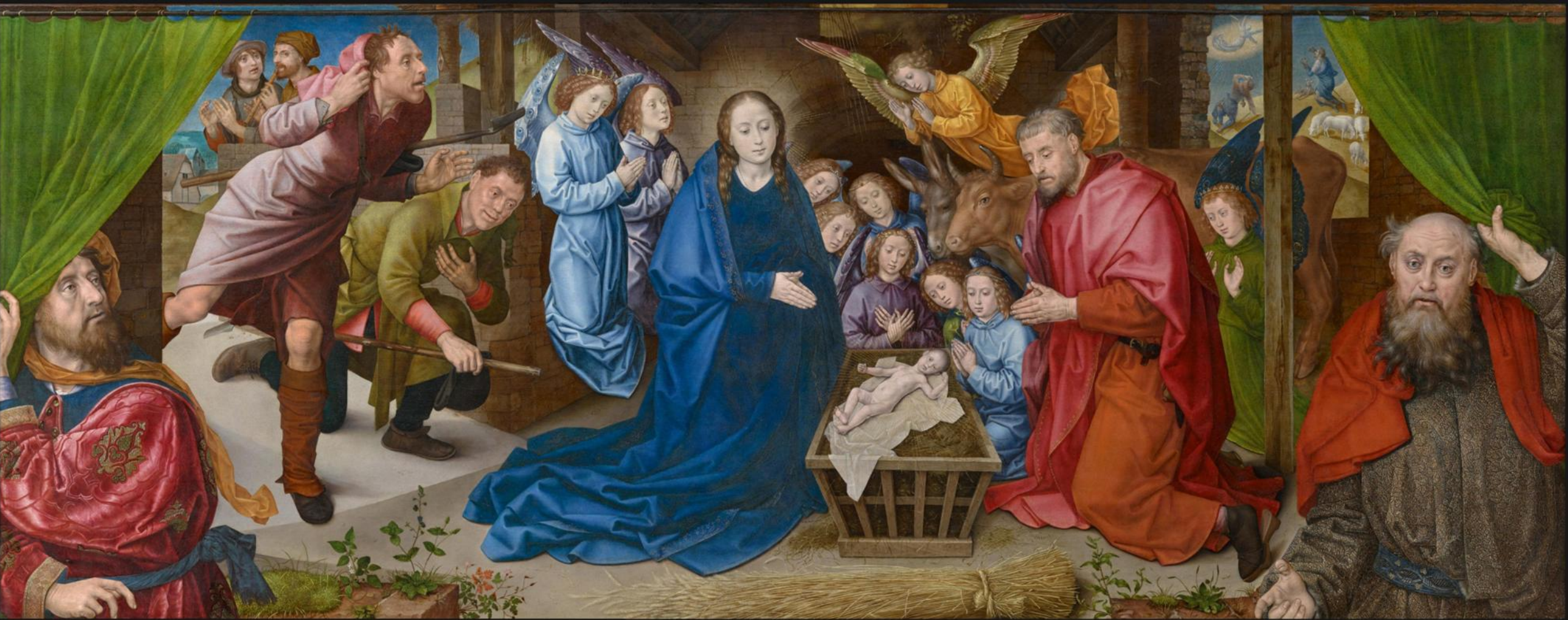
Hugo van der Goes, Nativity with Shepherds and Prophets