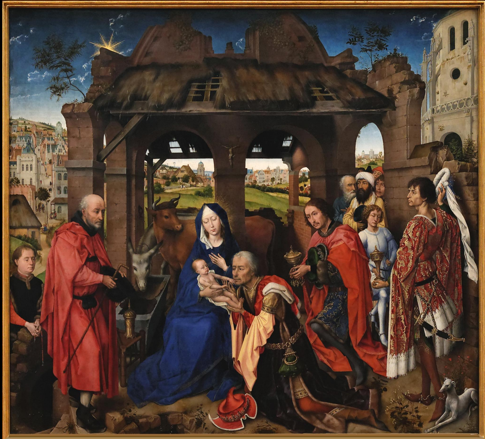
Rogier van der Weyden, Three Kings Altarpiece (Columba Altarpiece) , ca. 1451.