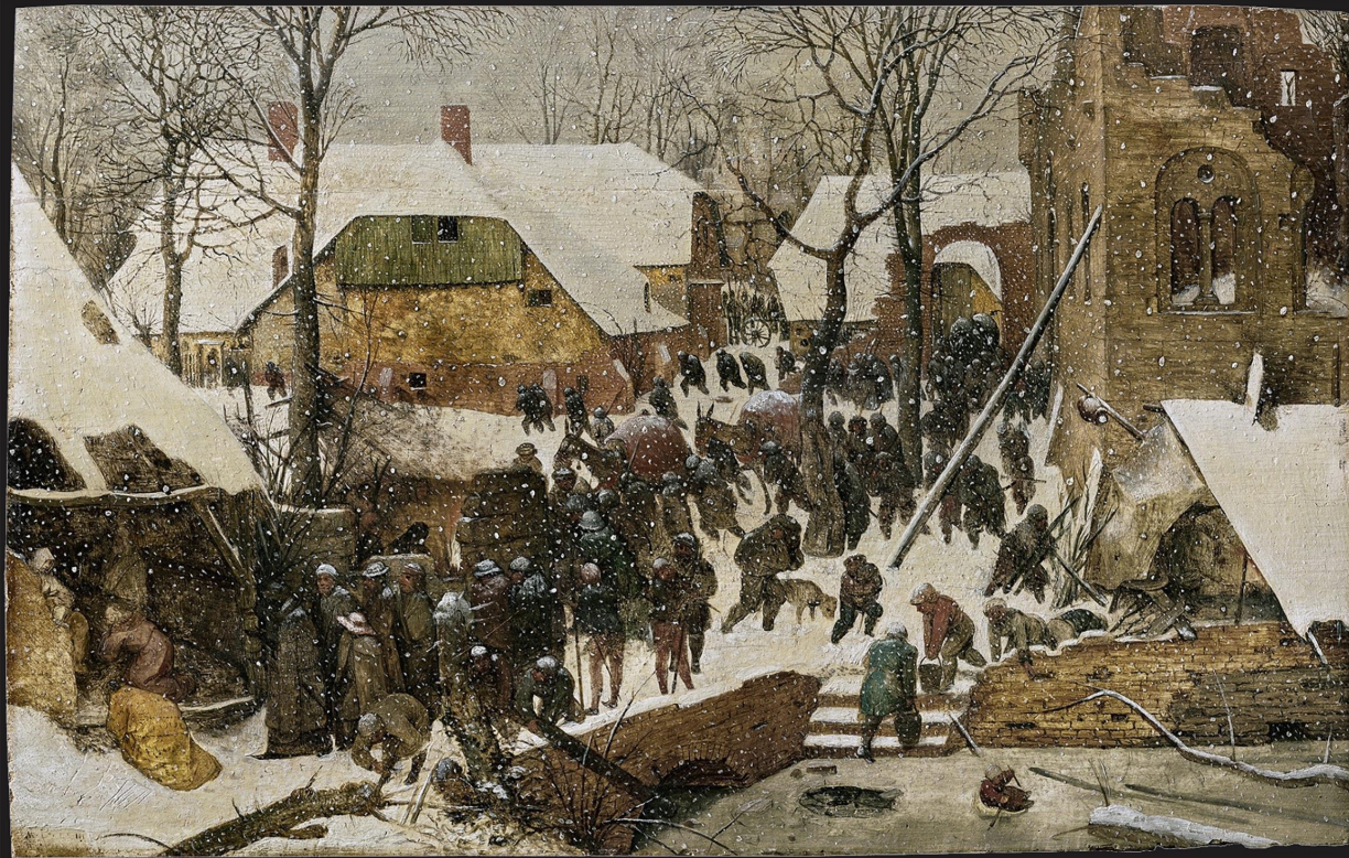
Pieter Bruegel the Elder