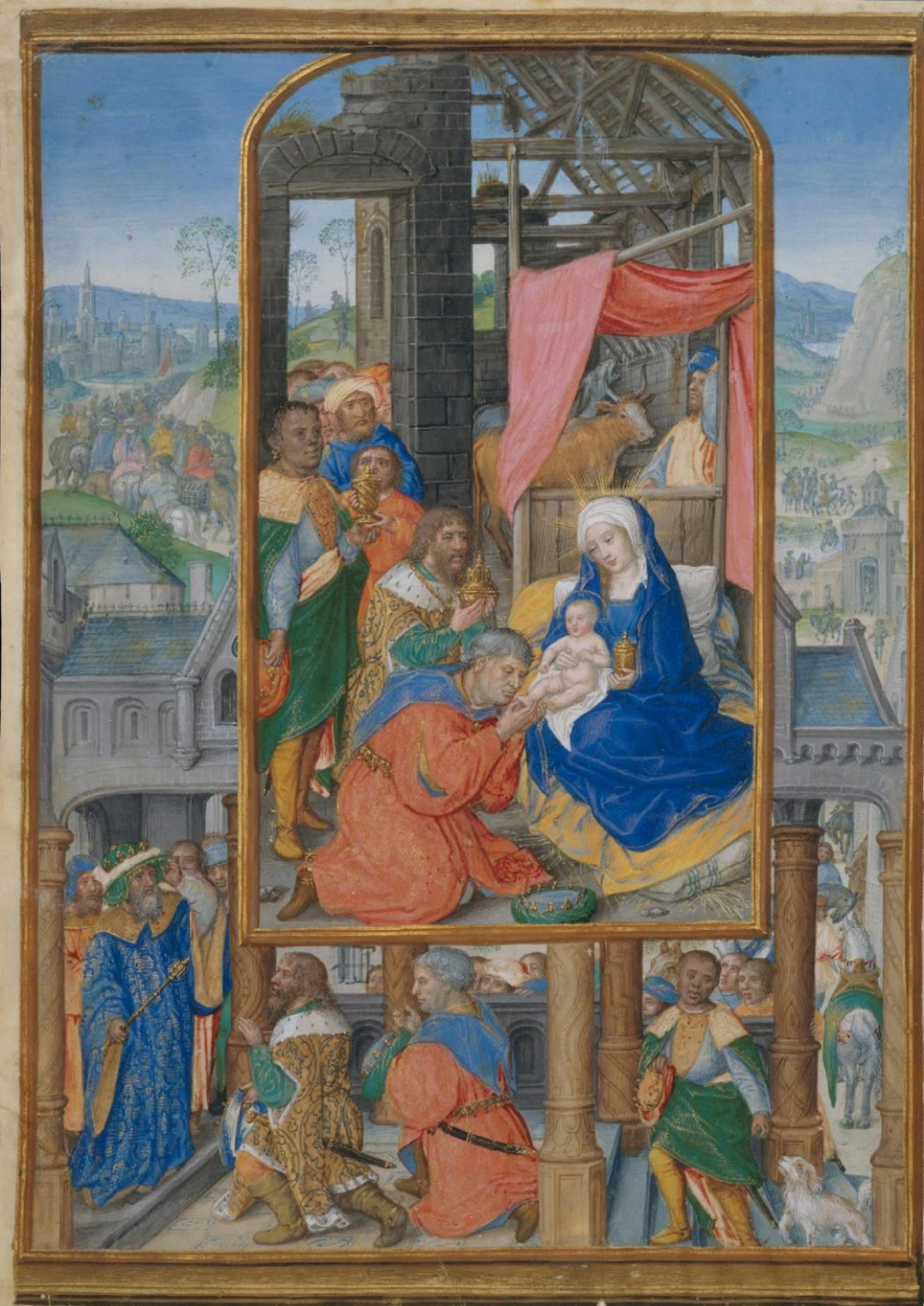
Master of James IV of Scotland Book of Hours: Adoration of the Magi (Bruges, ca. 1515-25)