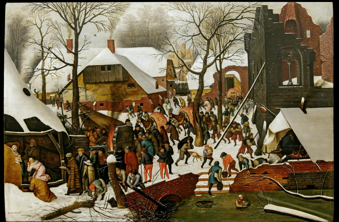
copy by Pieter Bruegel II (son)