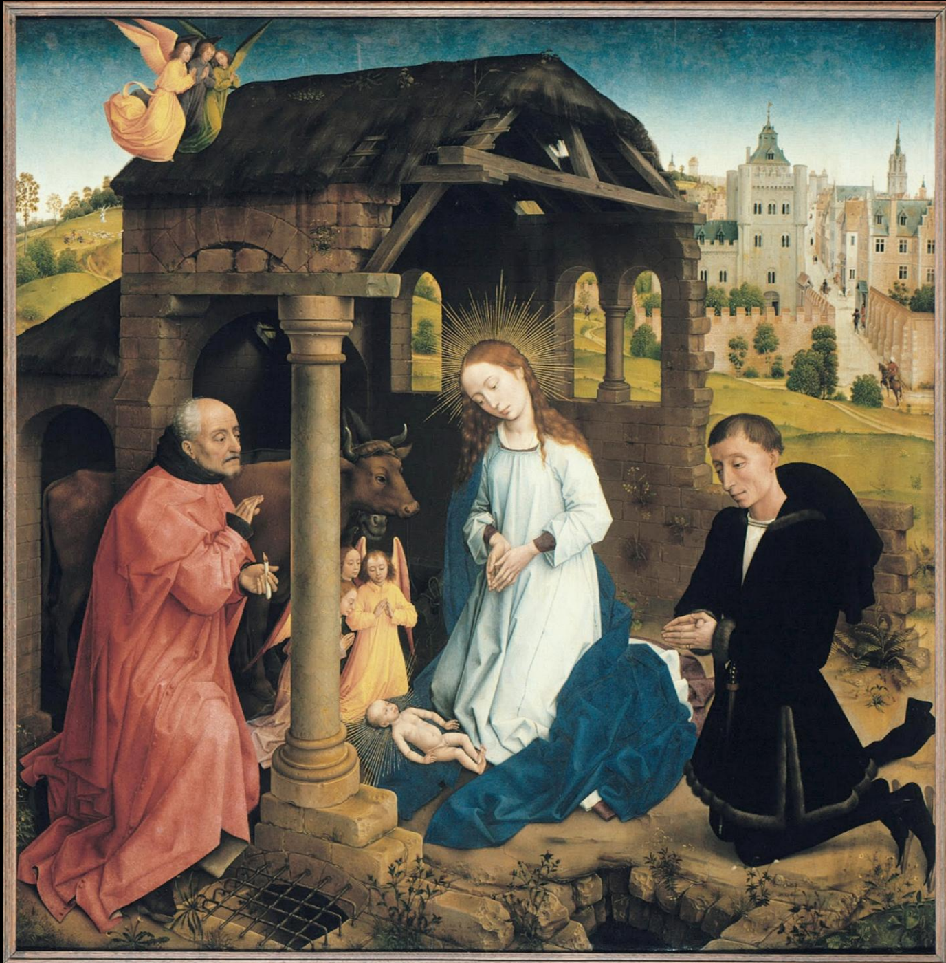
Rogier van der Weyden, Bladelin-Middleburg Triptych , center panel with Nativity. ca. 1450.