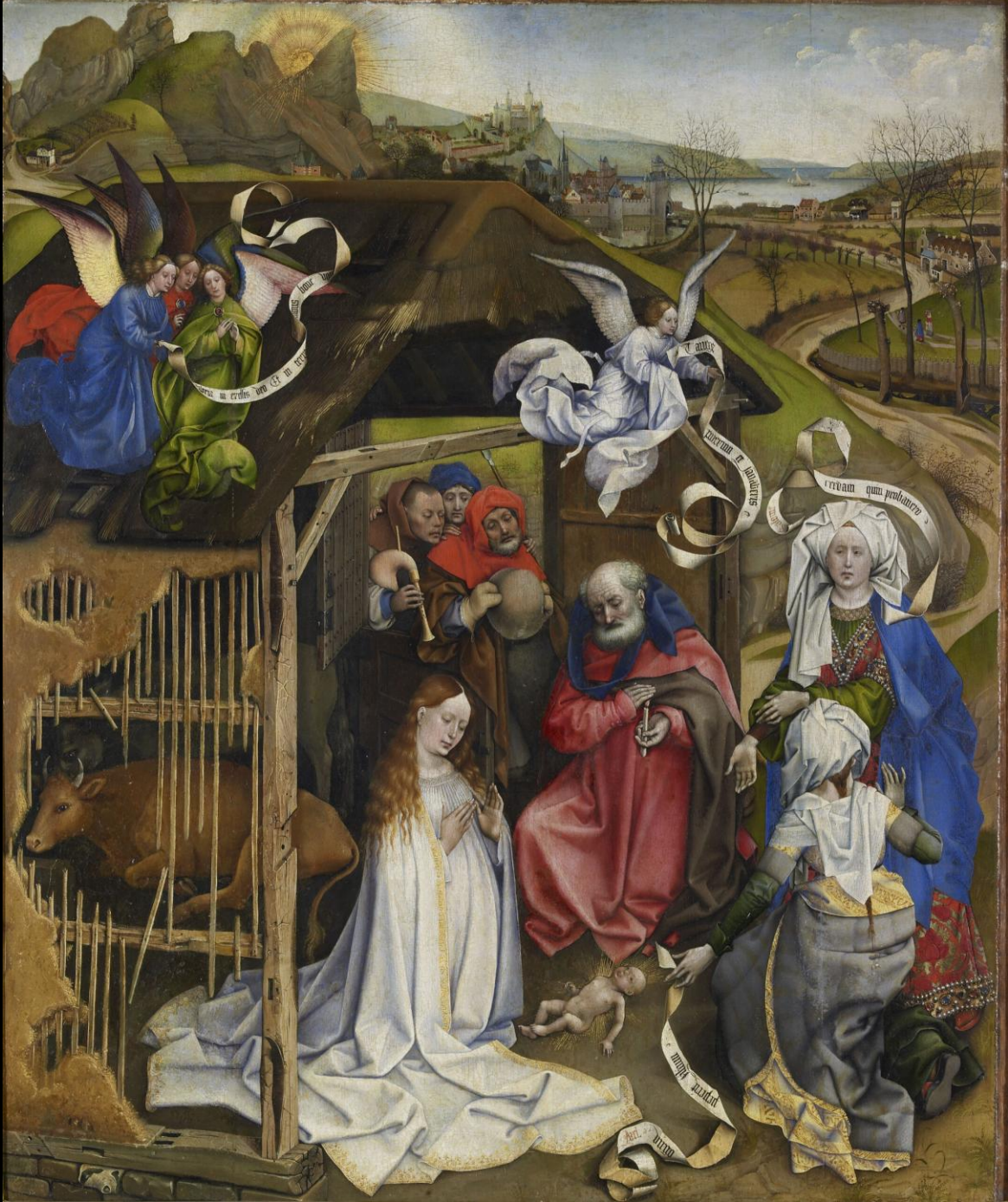
Robert Campin (Master of Flemalle) Nativity with Shepherds and Midwives (1430)