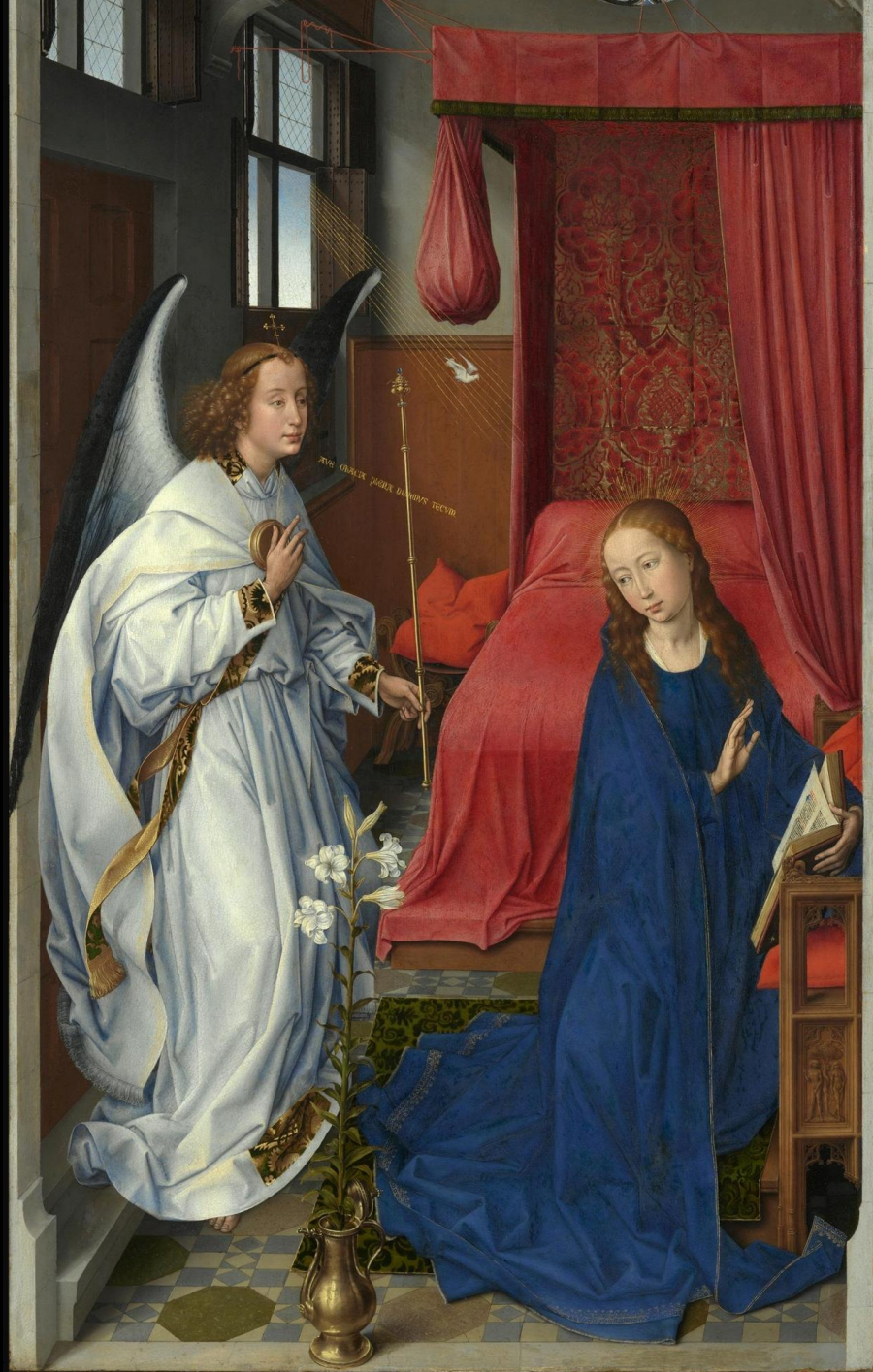
Rogier van der Weyden Annunciation , from the Columba Altarpiece (ca 1451)