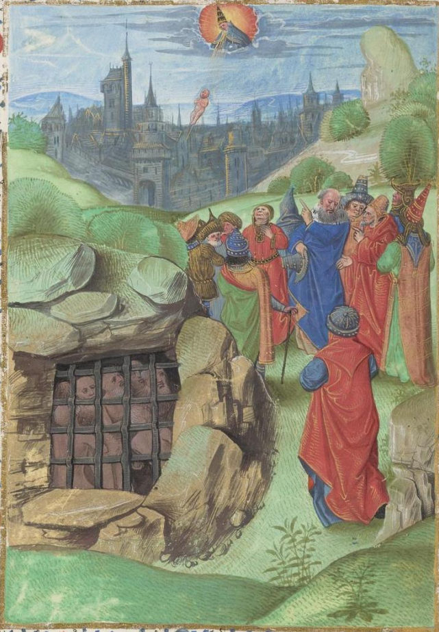
Pembroke Book of Hours , illustration depicting Christ's Advent. Netherlandish (Bruges?) 1465-1470.