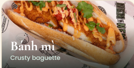
Bánh mì Crusty baguette