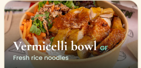
Vermicelli bowl GF Fresh rice noodles