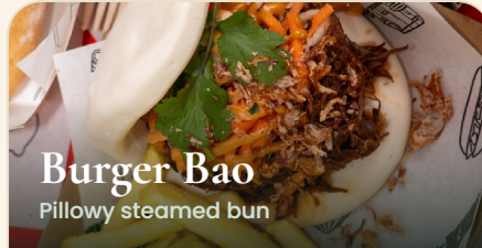
Burger Bao Pillowy steamed bun