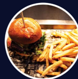
Cheese Beef & Bacon burger Served with chips 20.00