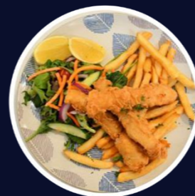
Crispy Battered Flathead Served with your choice of 2 sides lemon & tartare 20.00

Lunch Specials Only Available Monday to Friday Excludes Public Holidays