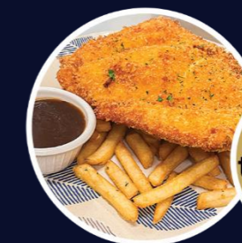
Chicken Schnitzel Served with your choice of 2 sides & gravy 20.00