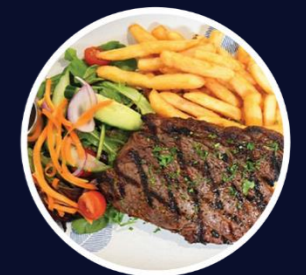
300g Riverina Rump Served with your choice of 2 sides & gravy 25.00