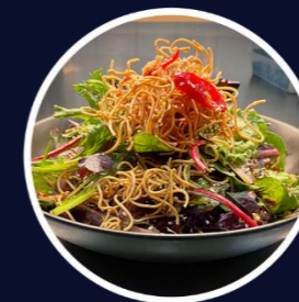
Thai Chicken Salad (GF) 20.00