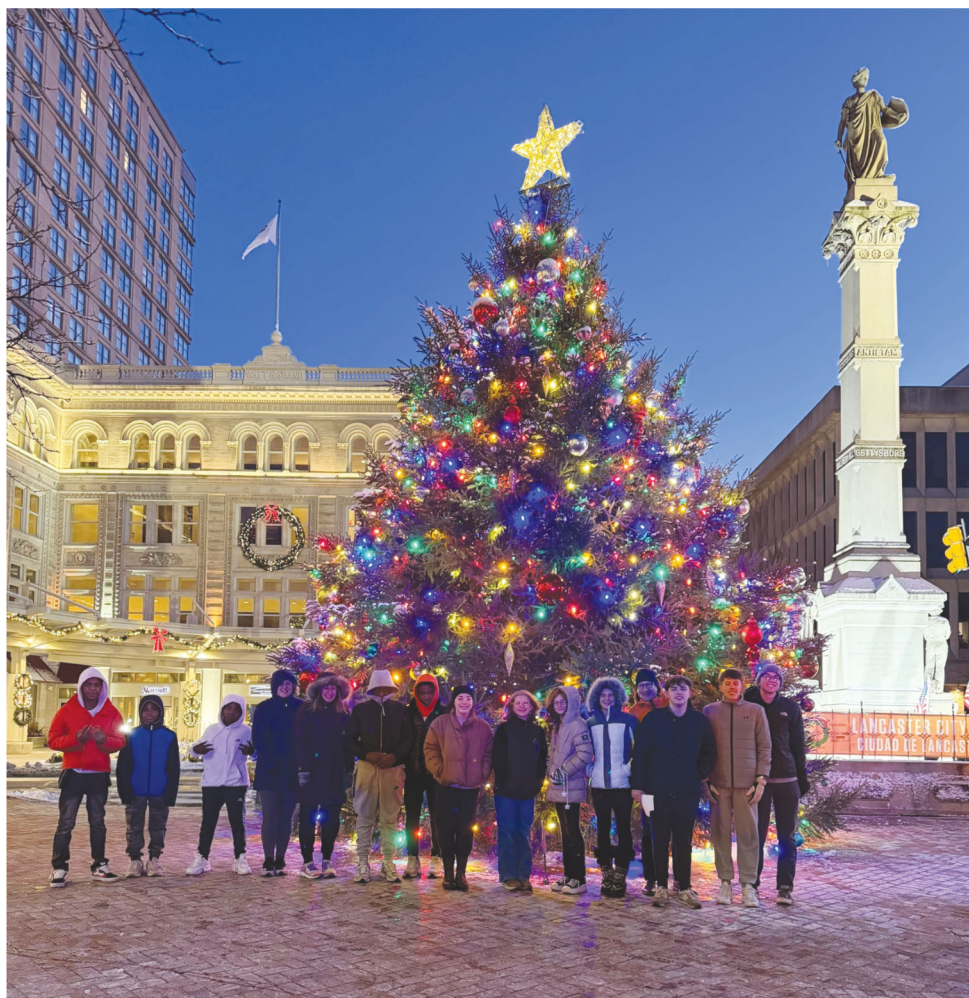
The FPC youth group held their Christmas party & scavenger hunt this last Sunday, December 7. The event included the study of the Christmas story in our beautiful Sanctuary.