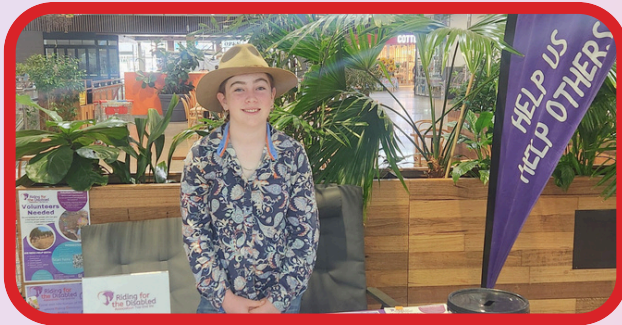
COTA RURAL EXPO