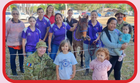
BREKKIE IN THE PARK