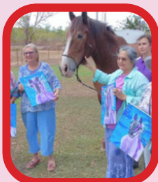
PAINT & PICNIC WITH A PONY