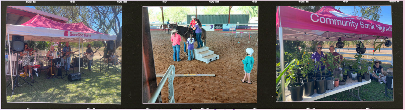
OPEN DAY 2025