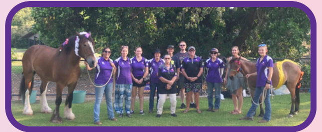
BALI VIBES BEACH ALIVE