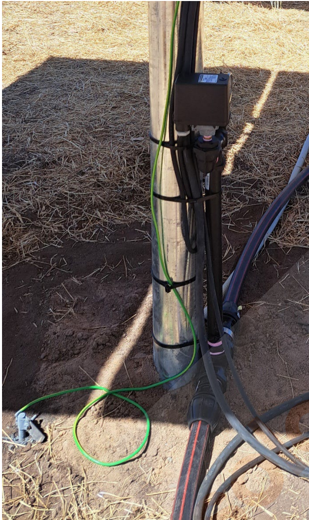
Figure 2.5 Earth Stake and pressure switch assembly cable tied.