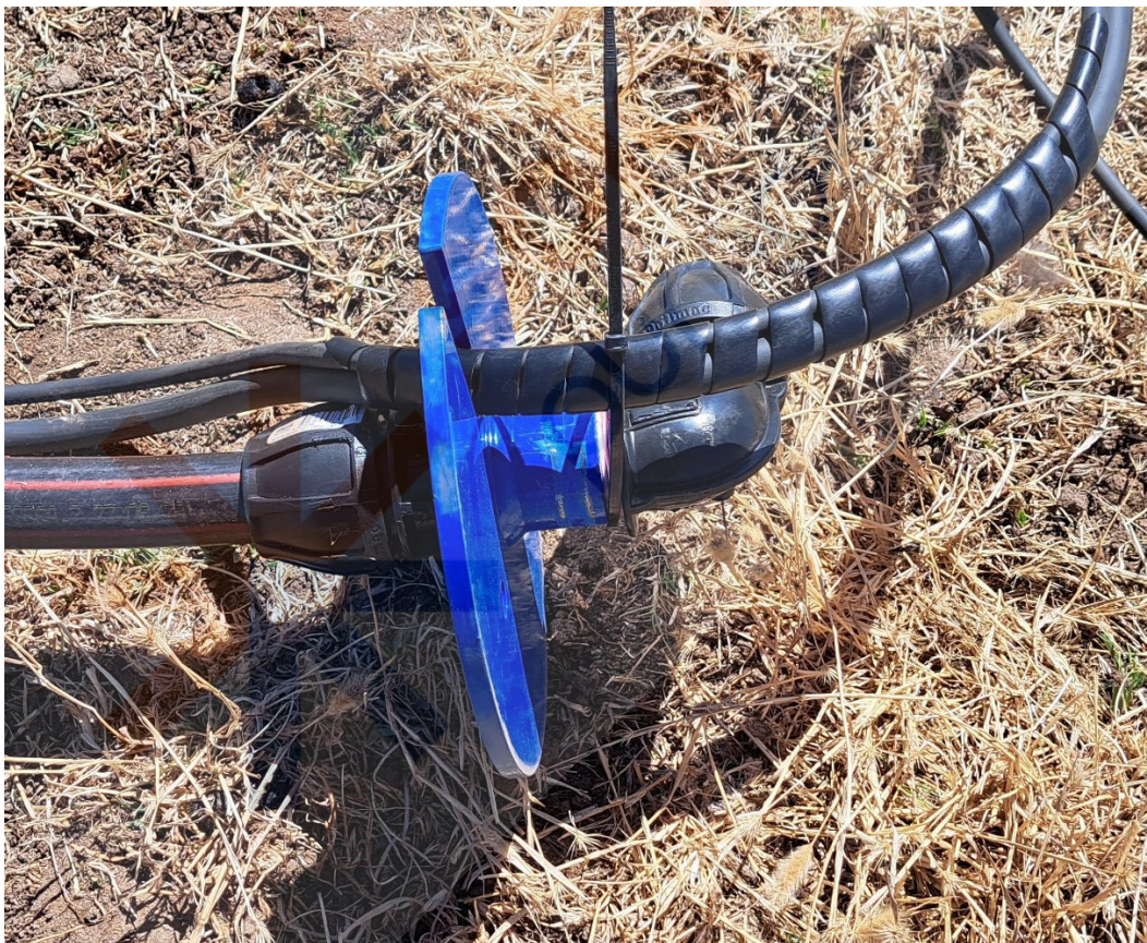
Figure 1.3 Threaded bore cap