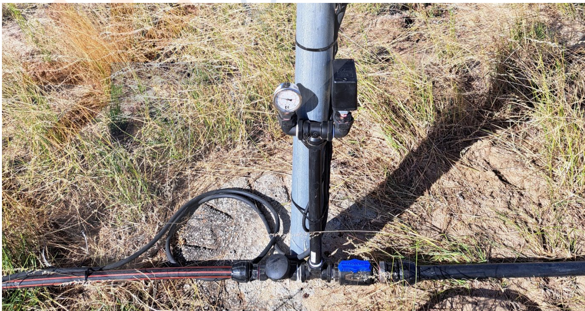
Figure 2.4 Pressure switch assembly with cable ties.