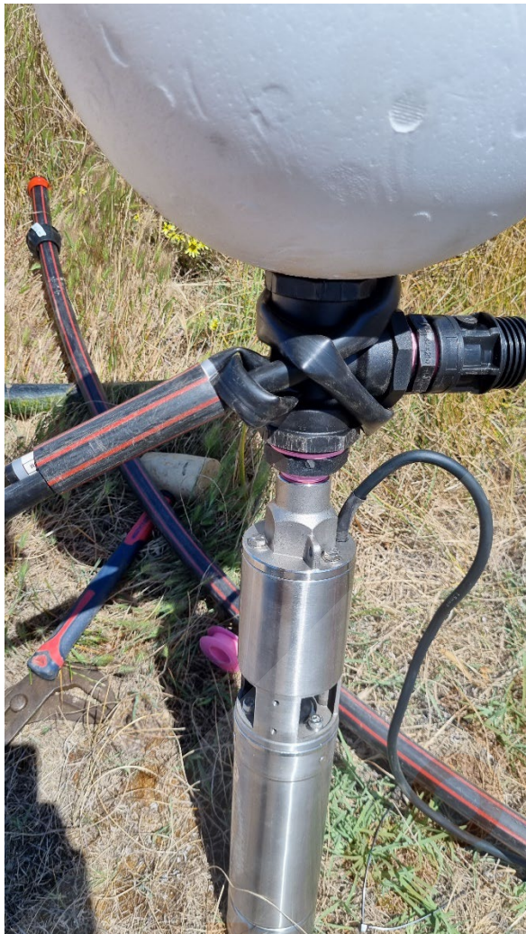
Figure 1.6 LD poly looped and sleeved around dam float assembly.