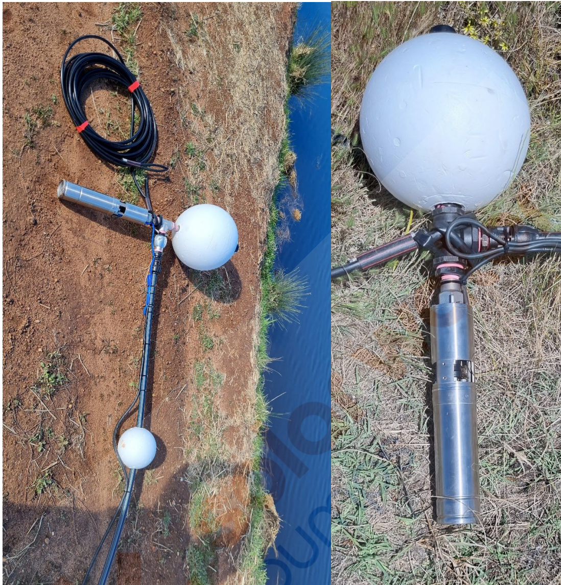
Figure 1.4 Dam float assembly and pump cable tied ready for installation.