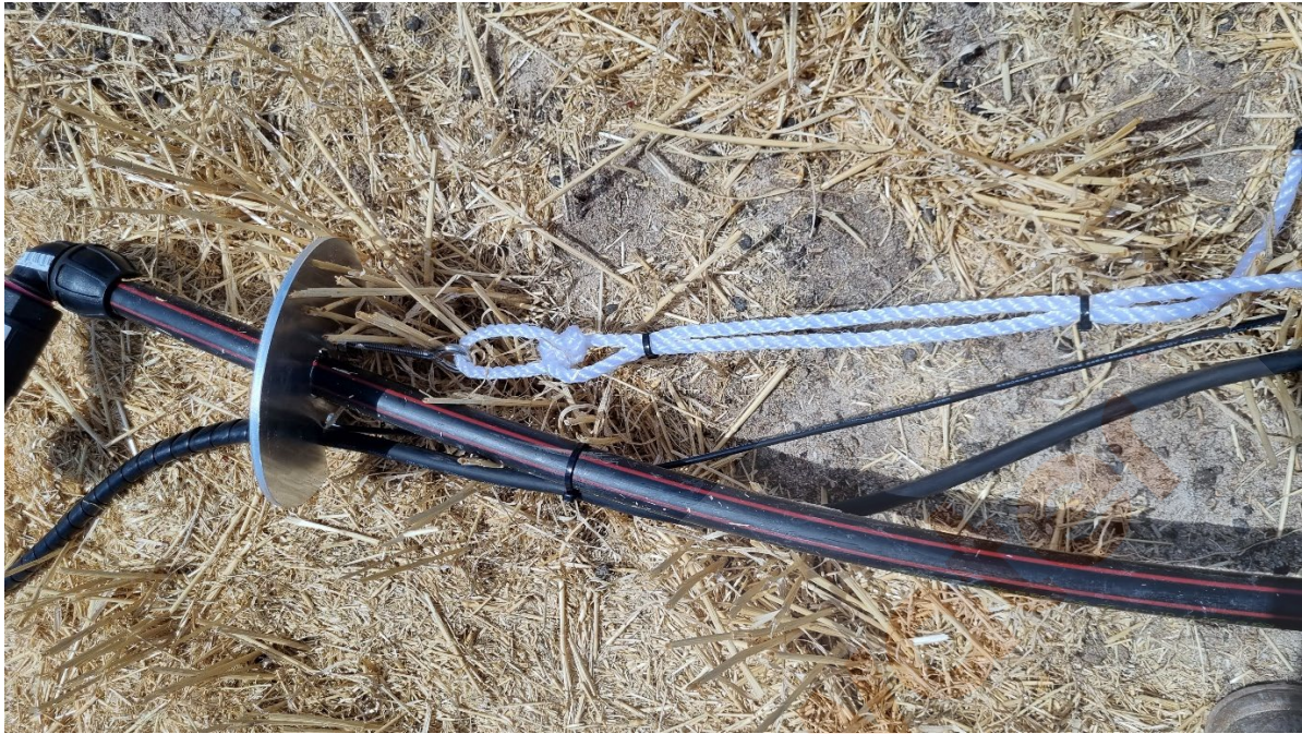
Figure 1.2 Aluminium bore cap with poly rope.