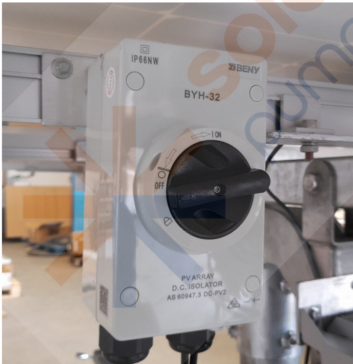
Figure 2.2 Isolator on rail (if included)