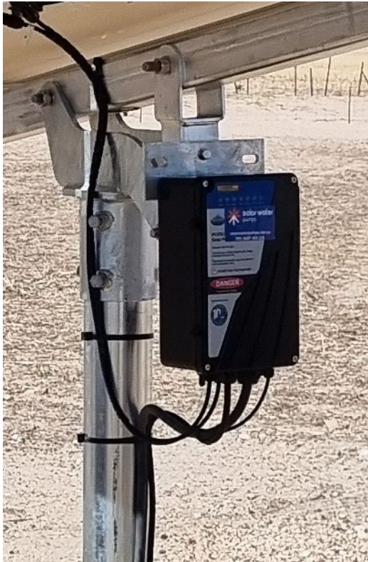
Figure 2.1 Waterboy 2-4 Panel controller mounting