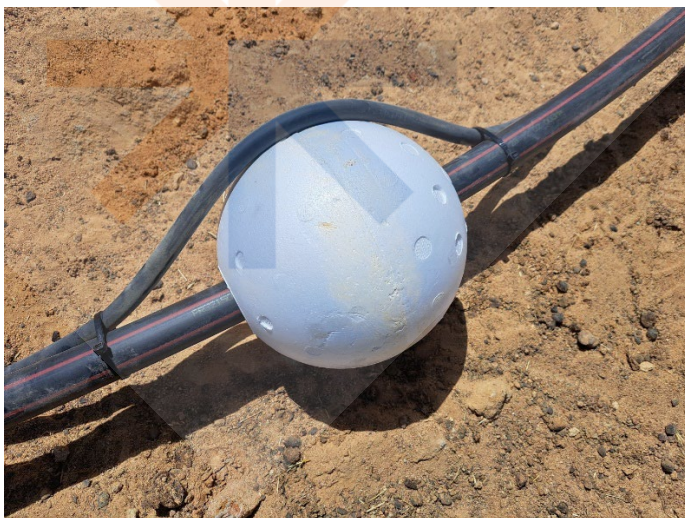
Figure 1.5 200mm pipe float cable tied on either side.