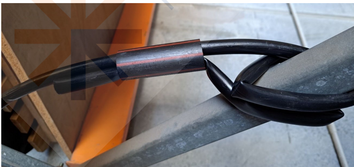
Figure 1.7 End loop for attachment on side of the dam.