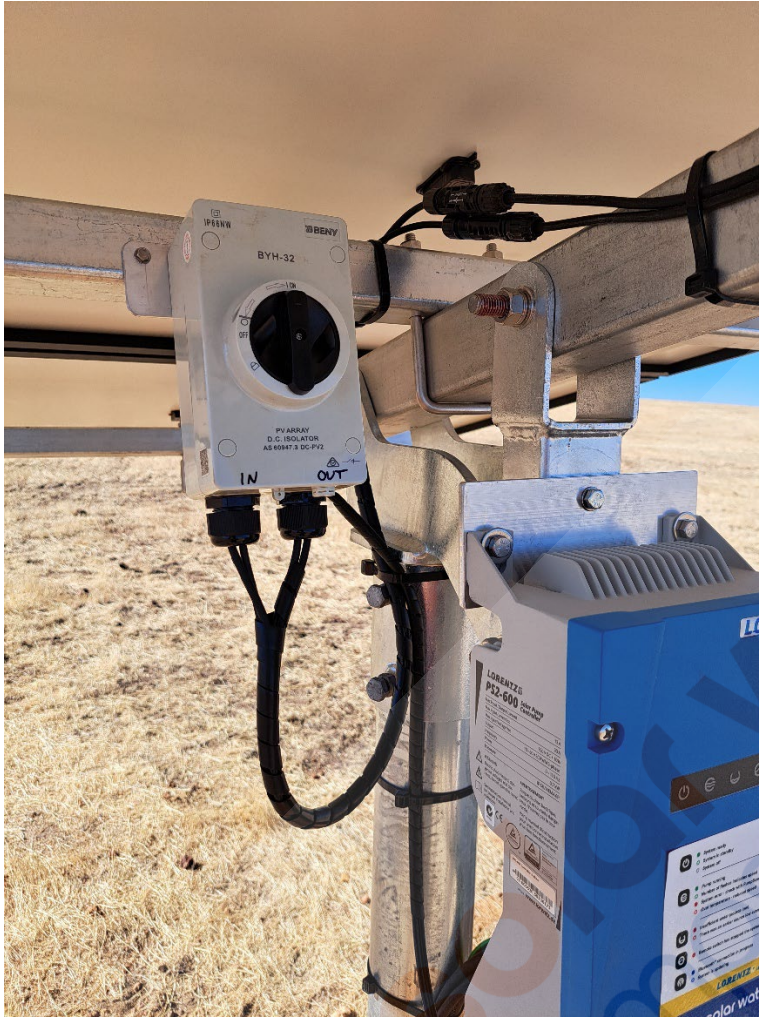
Figure 2.3 Isolator on beam (Please note Lorentz controller showed in image will be different to the controller you are installing)