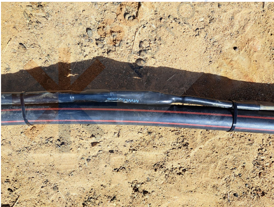
Figure 1.1 Heat Shrink with a cable tie on each side.