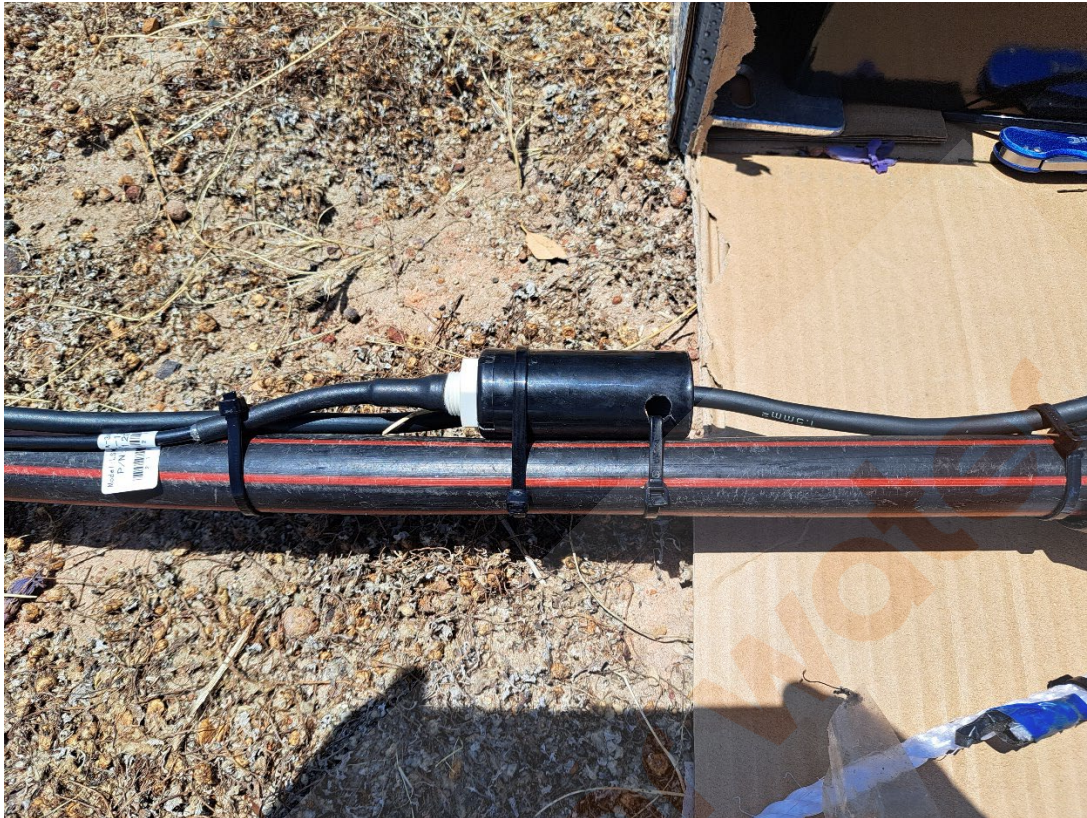
Figure 1.0 Low Level probe cable tied and secured.