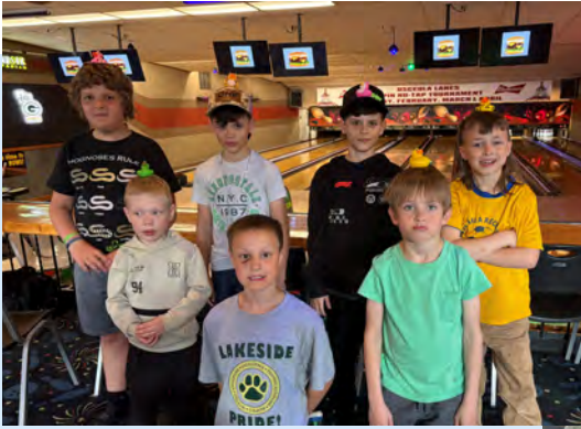
NOIZ kids went bowling for their year end party.