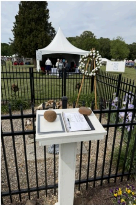
Flowers of the Forrest where a stone was placed for Charlie Diman