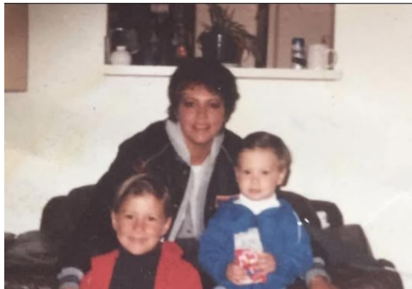
[What a beautiful mom you had!]

It is about a deep sense of belonging and pride that stays with you, no matter where you go in the world. Whether it is through music, history, or helping a neighbor, that “spirit” is the kindness and strength found in every glen and city. It is a bond that makes Scotland home.