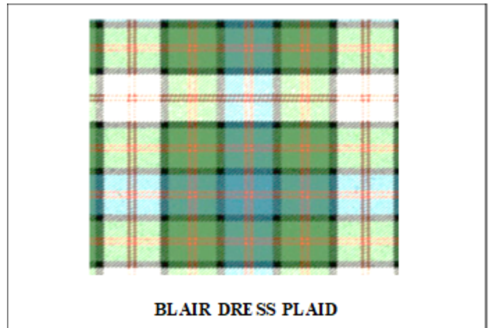
BLAIR DRESS PLAID