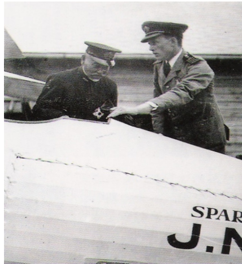
Lord Sempill showing airplane to Japanese Admiral Togo Heihachiro, 1921

Membership Chair, 3413 Sunnybrook Drive, Charlotte, NC 28210-4715