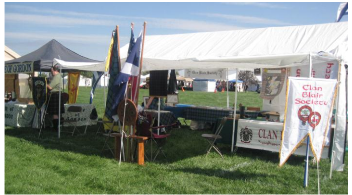
Clan Blair Tent, August AGM