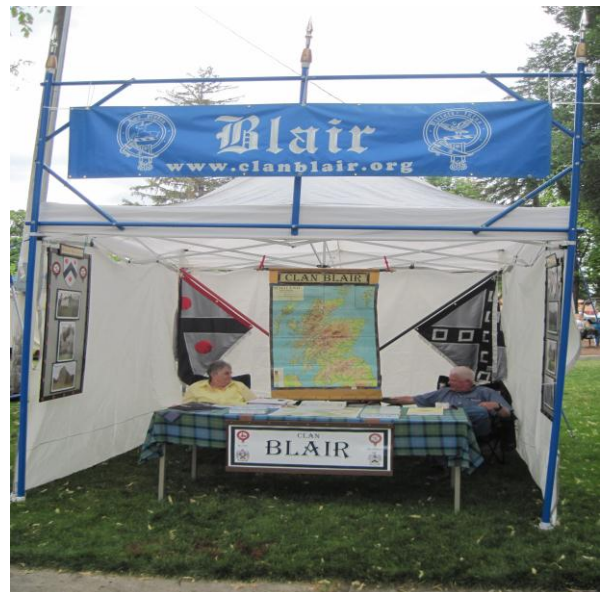
Blair-Payson-2012-1) Bette Jane Blair and Thomas Blair

Friday evening, strong winds and rain assaulted the booths and again on Saturday. The winds were so strong in the evening that broken limbs from the tall trees damaged some of the Clan tents and vendor booths. Clan Blair was spared, and in fact we were able to provide shelter for a few visitors during the storm by pulling the display table into the back of the canopy so that they could have a place to sit out the storm. We are grateful for the information assembled by the Clan Blair Society that we were able to share with all who showed an interest.