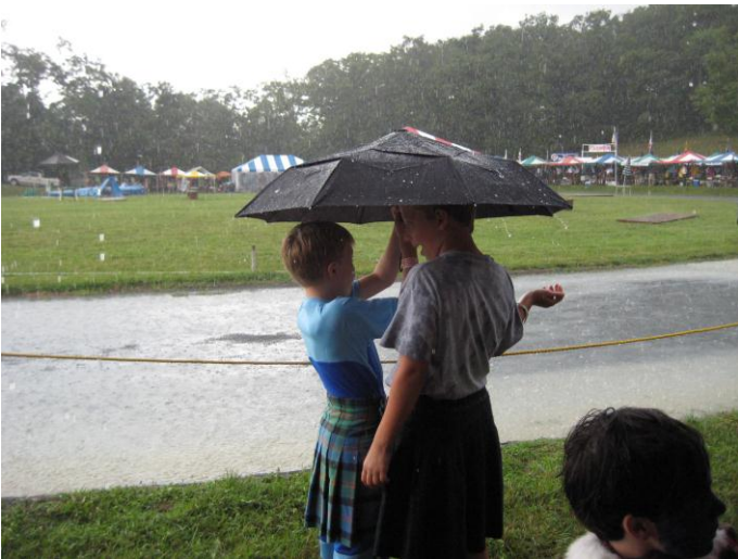
Diman boys in the rain