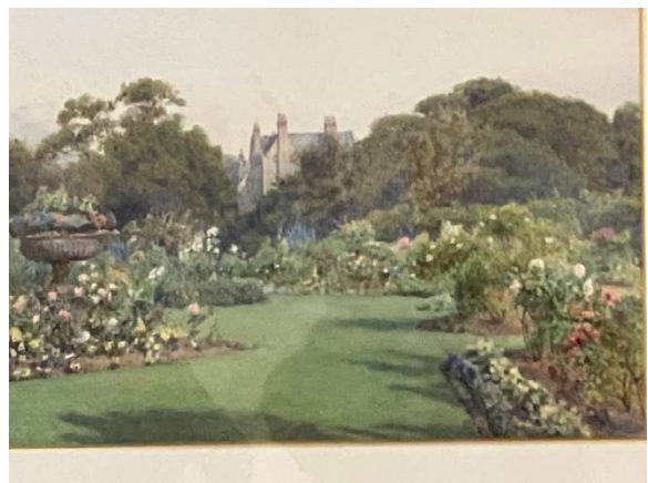
Some of the stunning rose hedges at the carriage house