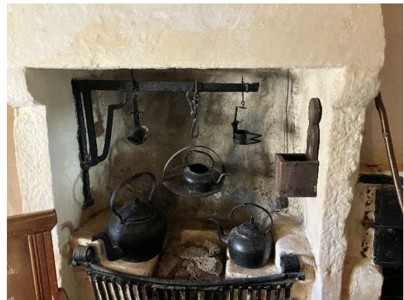
Birth home of Robert Burns