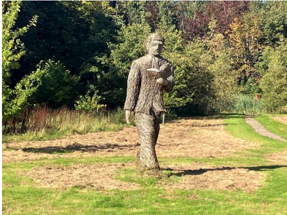
Robbie Burns fashioned out of straw, reading in his childhood back yard