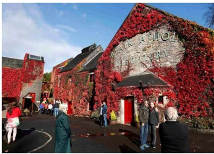
Blair Athol Distillery

Being so near to Blair, we naturally had to stop at the distillery for Blair Atholl Scotch, which had a stunning display of Virginia creeper on its walls.