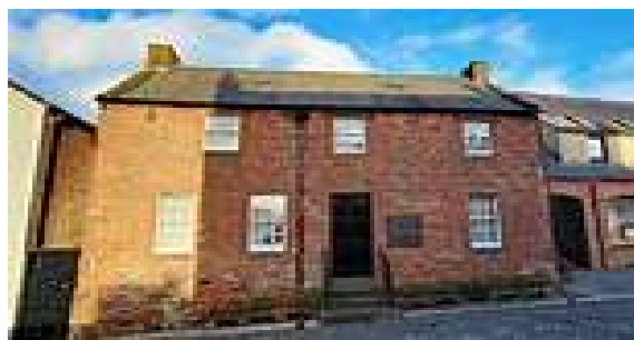
House where Burns died in Dumfries