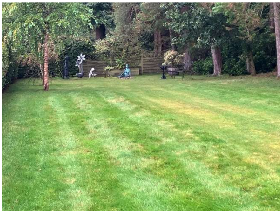
The outdoors of the carriage house here and above