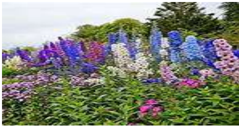
Outside, Dumfriesshire House's many gorgeous gardens