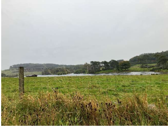
Ladymuir Farms, land and Lake

sharpened the green of the countryside and lakes. We drove through the nearby cities and villages. Beautiful scenery.