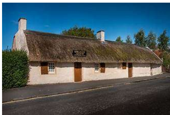
Robert Burns' birth home in Dumfries