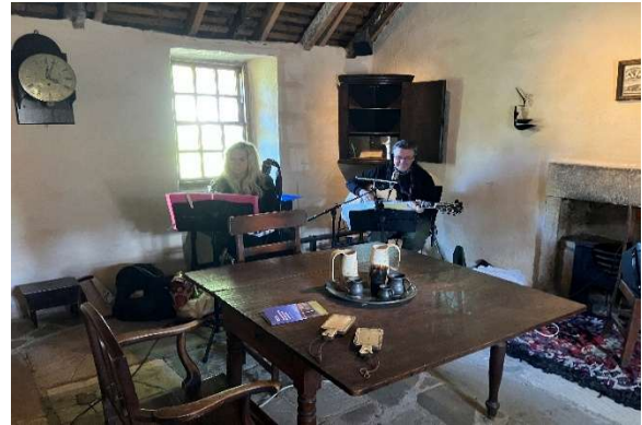
The home had 3 rooms, one of which held the animals! Here, we found 1700's music!